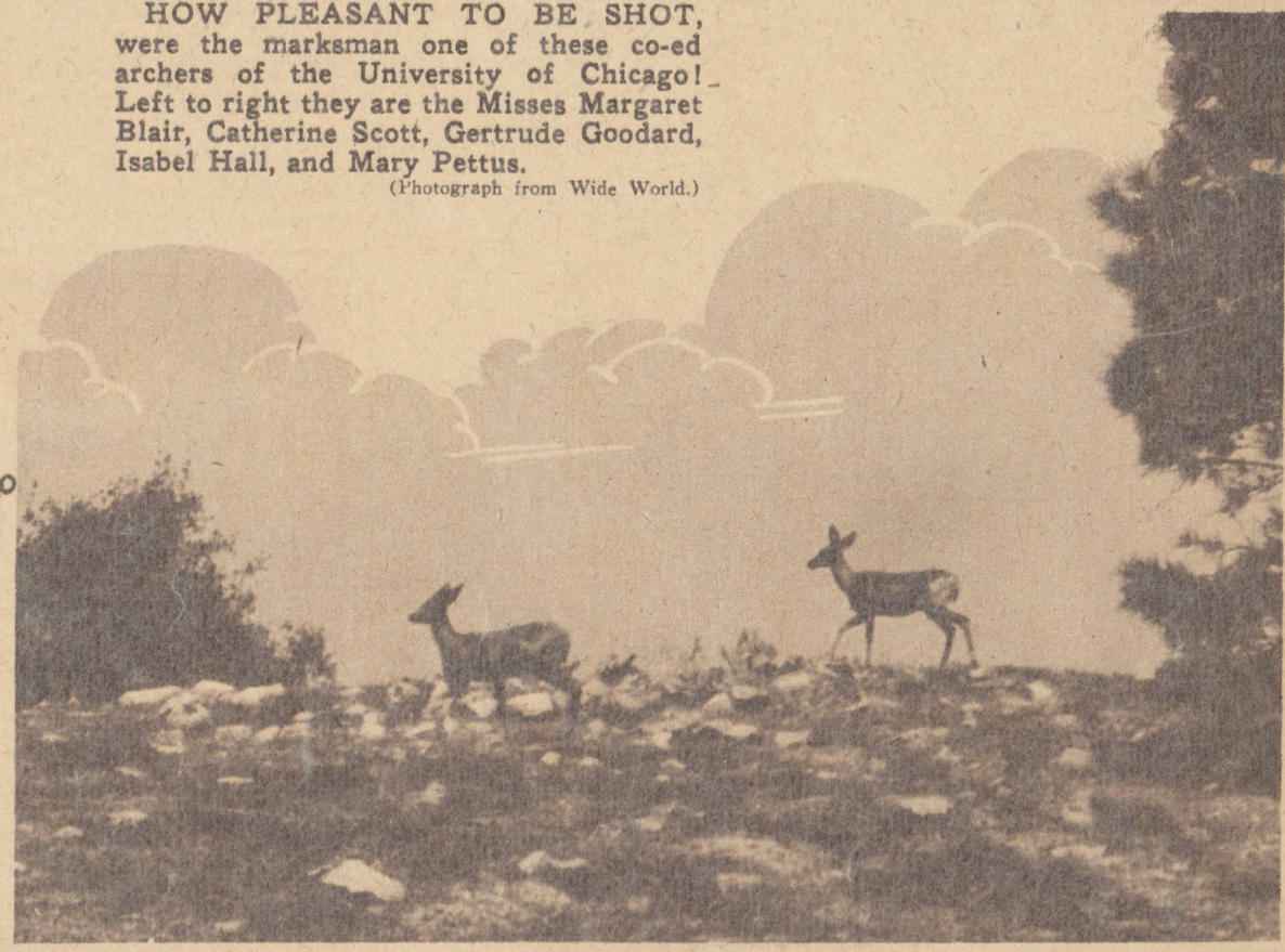
OUT IN THE GREAT OPEN SPACES —A camera shot of two wild white-tailed deer in the mountains of California. The next shot at one or both of this pair will probably come from a rifle—which won't be so nice for the deer.