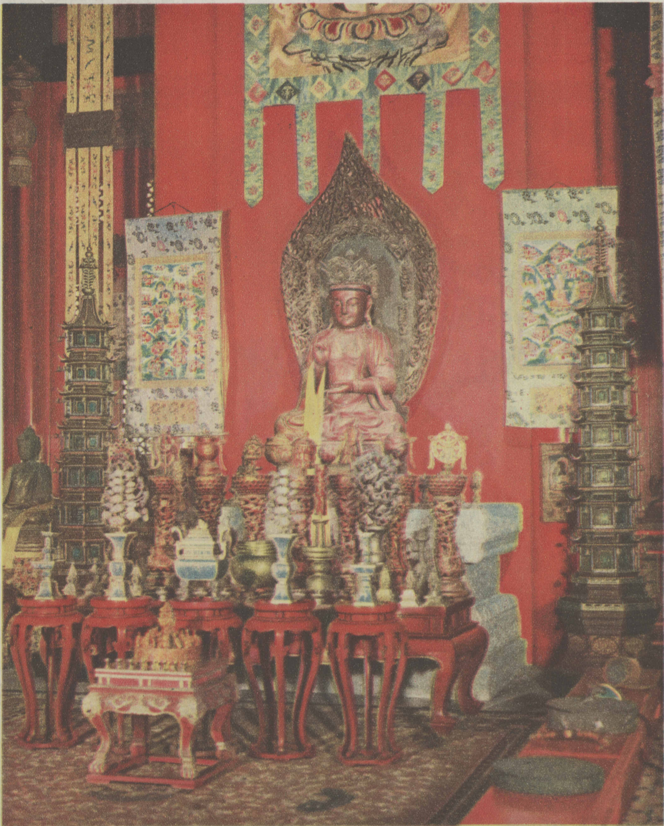
INSIDE THE GOLDEN TEMPLE OF JEHOL AT THE EXPOSITION. THIS REPLICA OF THE FAMOUS BUDDHIST SHRINE WAS BUILT IN CHINA.

A Full Page Portrait of the Queen of the World's Fair Inaugural Will Be Presented on This Page Next Sunday.