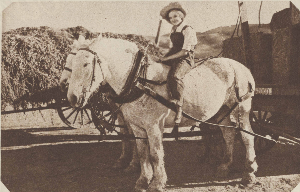
WELL, I'LL BE SWITCHED, THE HAY AIN'T PITCHED—Marian Marsh dons a pair of overalls, mounts one of a team of fiery nags, and helps bale the horses' spinach during a vacation from the movie lot. But so far as we know it isn't to lift the mortgage on any old homestead.