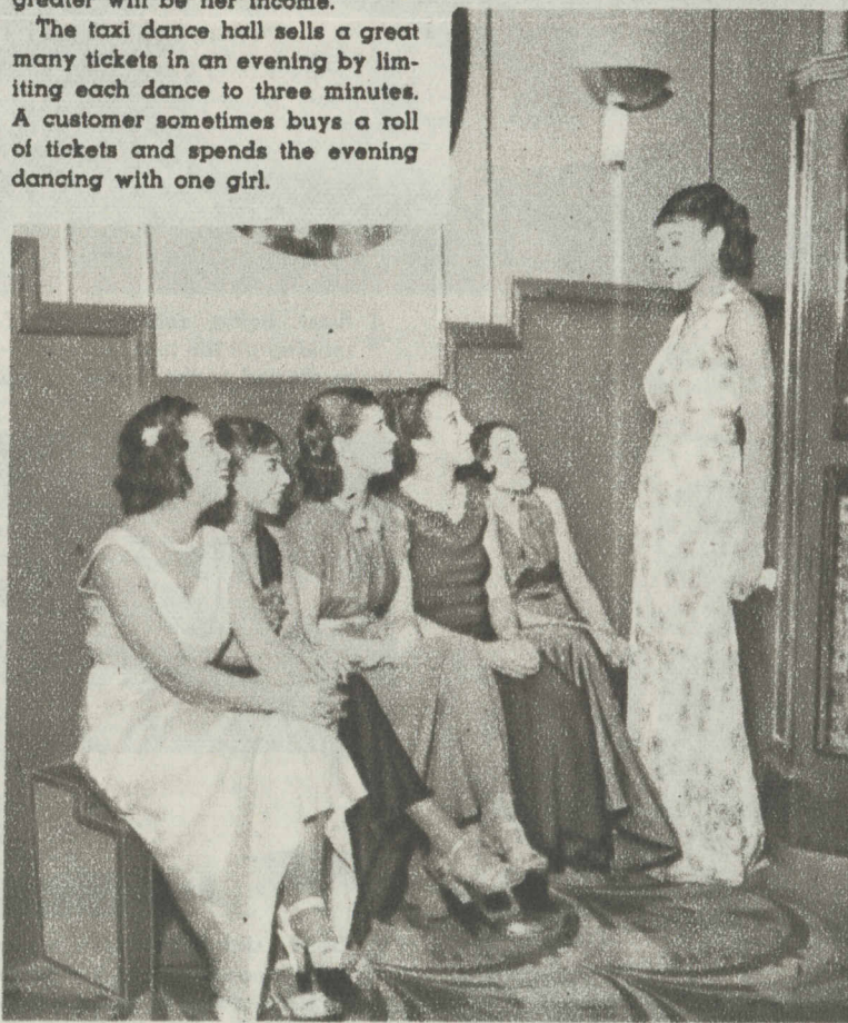
3 Dusky belles of New York's Harlem waiting to be selected for a dance in one of the district's bizarre ballrooms.