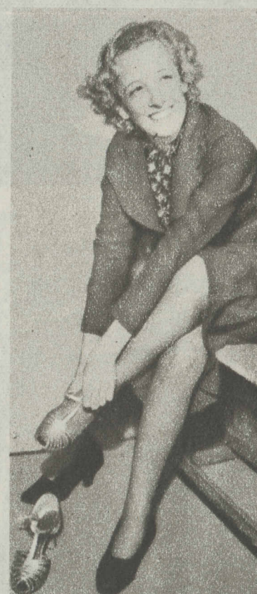
4 A Chicago taxi dance hostess catches a moment of rest to ease her overworked feet. Taxi dance hostesses always have to keep smiling.