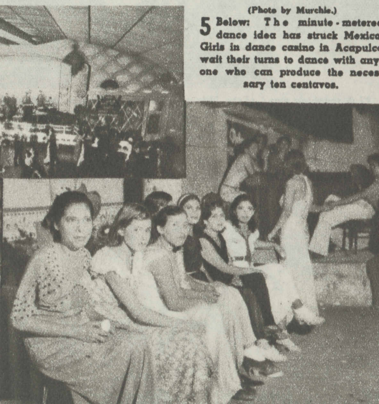
5 Below: The minute-metered dance idea has struck Mexico. Girls in dance casino in Acapulco wait their turns to dance with any one who can produce the necessary ten centavos.

6 Even in far-off Japan the taxi dance craze has swept the young people onto their feet. To the tunes of a Filipino orchestra the youth of Tokio prance and glide for three minutes for the price of a ticket. Income from tickets pays the girl hostesses and supports the management of the dance hall.