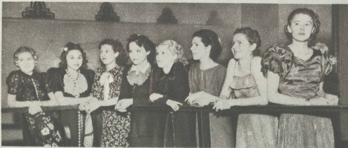
1 Lined up behind a railing. These girls add to their meager incomes by acting as dancing partners for the men who swarm to a Chicago taxi dance hall.