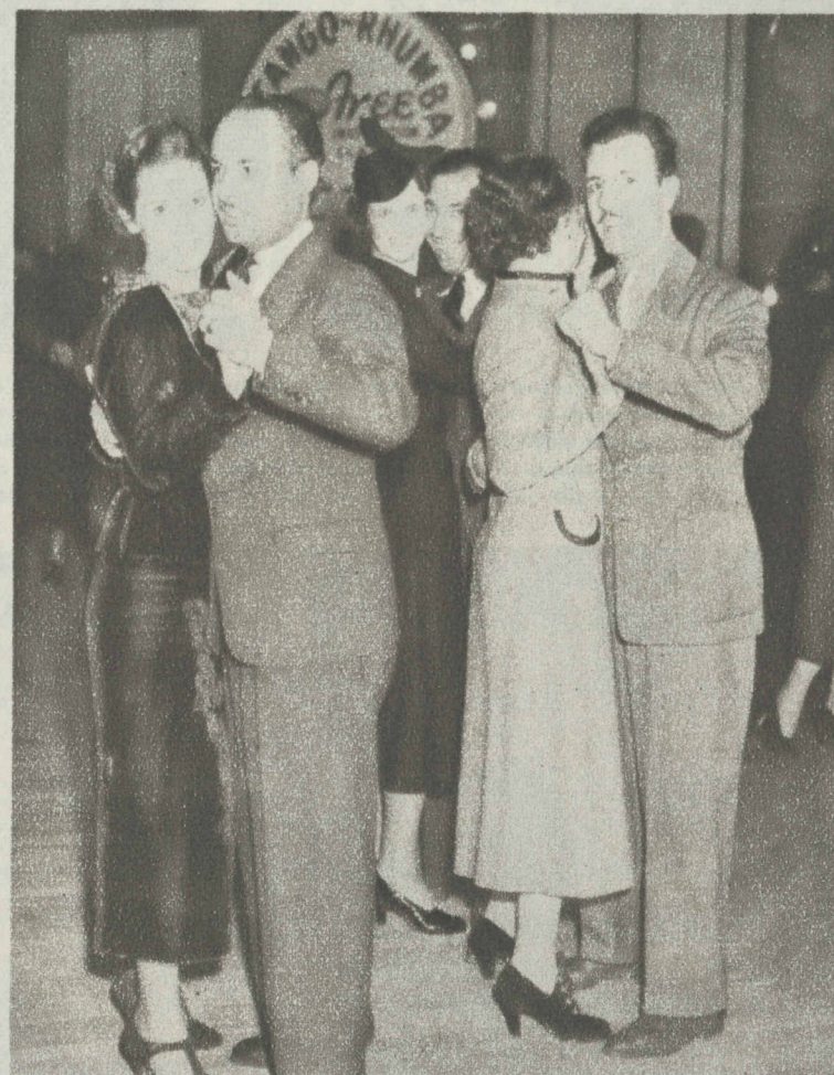
2 A New York taxi dance, where the men pay ten cents for a brief round of the dance floor.

The taxi dance hall sells a great many tickets in an evening by limiting each dance to three minutes. A customer sometimes buys a roll of tickets and spends the evening dancing with one girl.