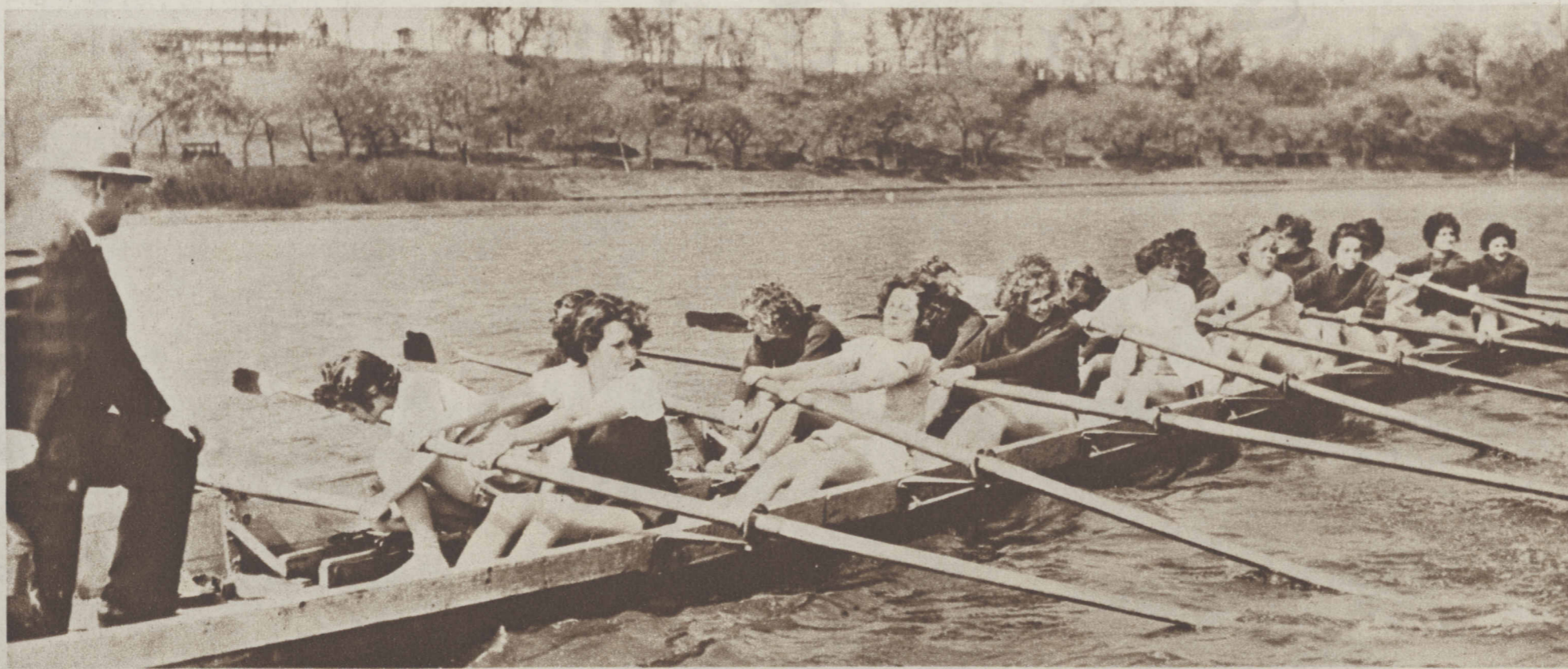
OARSWOMEN OF THE UNIVERSITY OF PENNSYLVANIA—Students of the Women's college work out in a training barge.