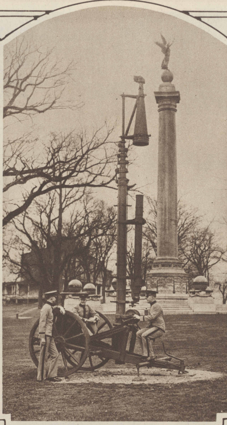
A LAND-GOING PERISCOPE, used by the former German crown prince during the World war, joins with a trio of cadets to supply picturesque interest to a West Point scene.