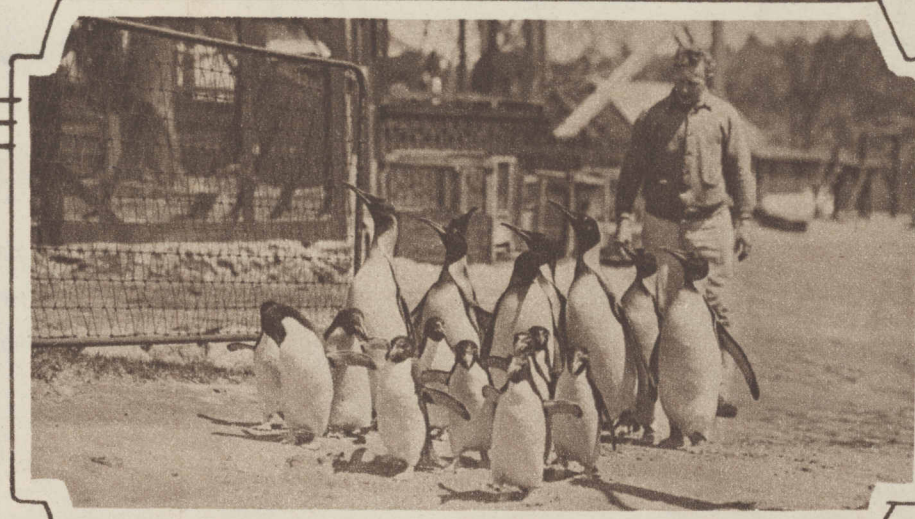
BIRDS THAT WALK LIKE A MAN, fat, solemn, and self-important, come from the Antarctic to the menagerie of an animal farm at Nashua, N. H. The big fellows are king penguins; the little ones are rock-hoppers, another penguin species.