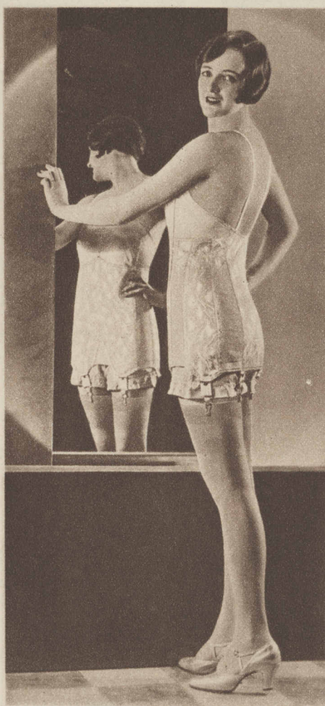
Bon Ton Décolletan Dualiste 804 E. Of soft broche and elastic with swami up-lift top... in the new flattering color—silver-beige. Price $7.50