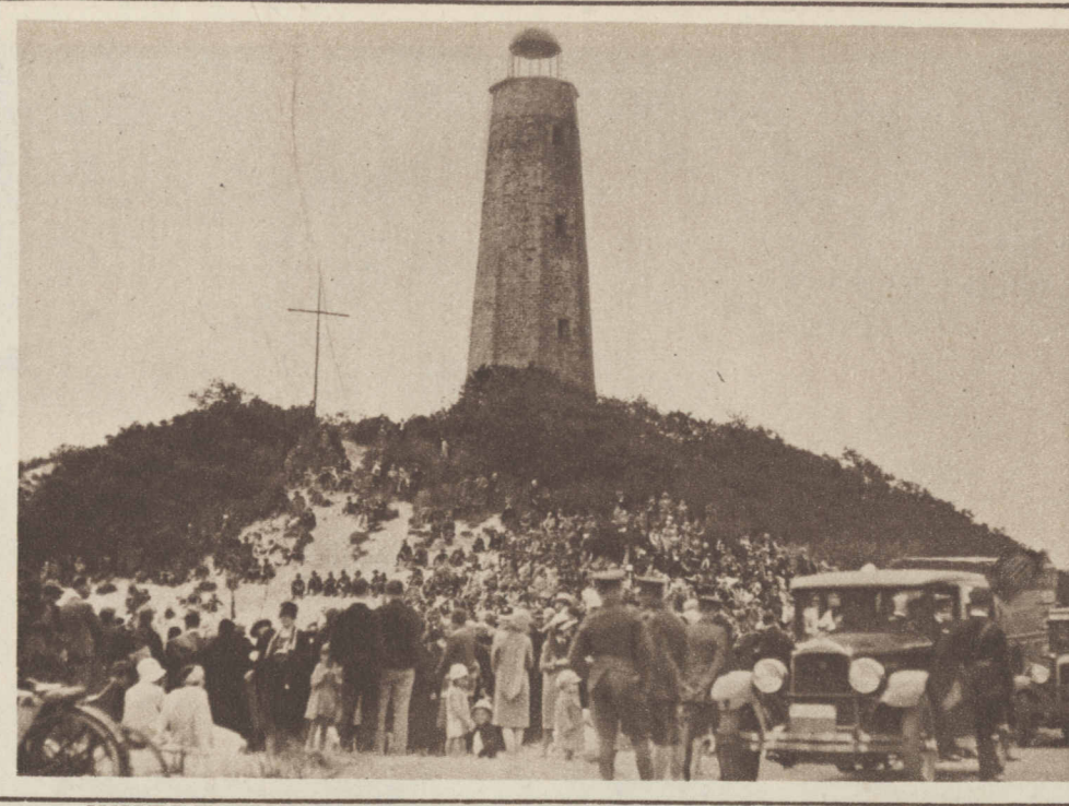
WHERE THE FIRST SETTLERS LANDED—Gov. O. M. Gardner of North Carolina was the speaker at commemoration exercises held in the shadow of the lighthouse at Cape Henry, Va. It was here in 1607 that the first Englishmen coming to America disembarked, but were driven back to their boats by the Indians, and thereupon proceeded to Jamestown.