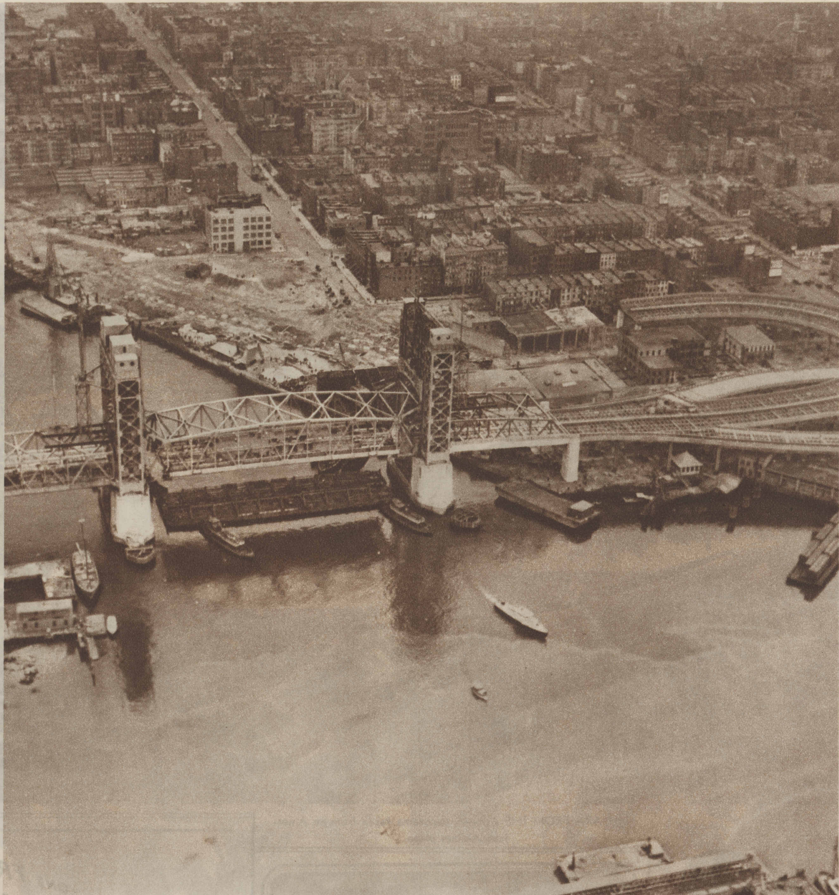
A NEW FEAT IN ENGINEERING —The 2,000 ton lift span of the Tri-Borough bridge, New York, is floated into place and lifted fifty feet into position from the car floats on which it was built. Above, the first step; at right, the span in position.