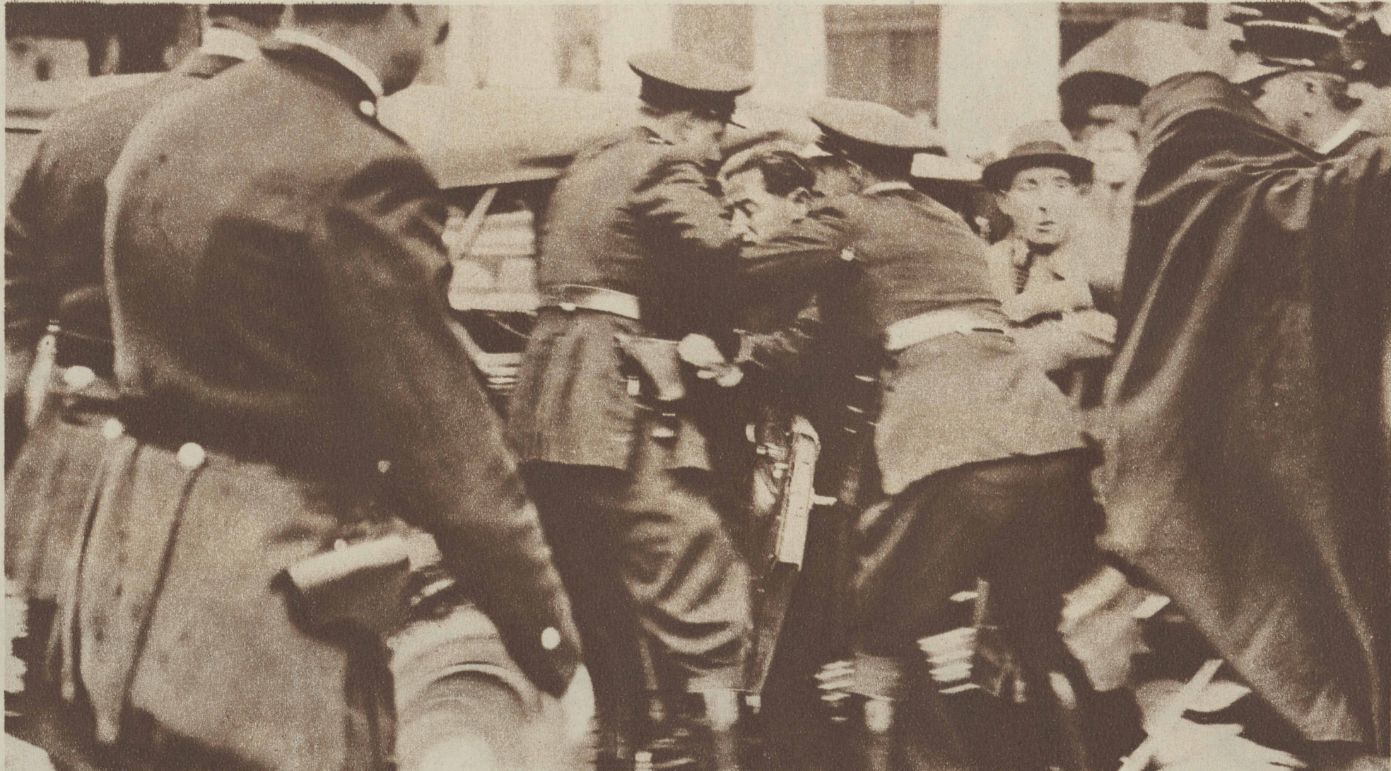
RIOTS FLAME IN SPAIN—Police arresting an agitator during political warfare in Madrid.