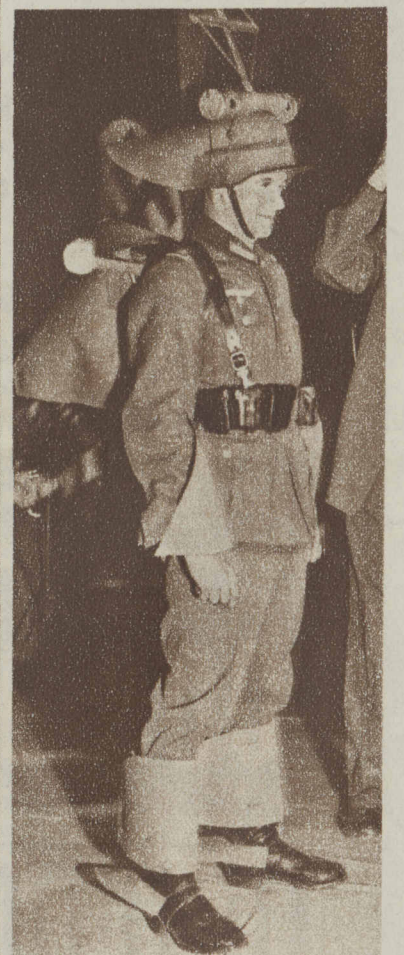
A STREAMLINED SOLDIER, as conceived in Germany, makes his appearance at a military fete.

AVAILABLE IN TWO SEDAN BODY TYPES. CONVENIENT TERMS THROUGH UCC ½ PER MONTH FINANCE PLANS.