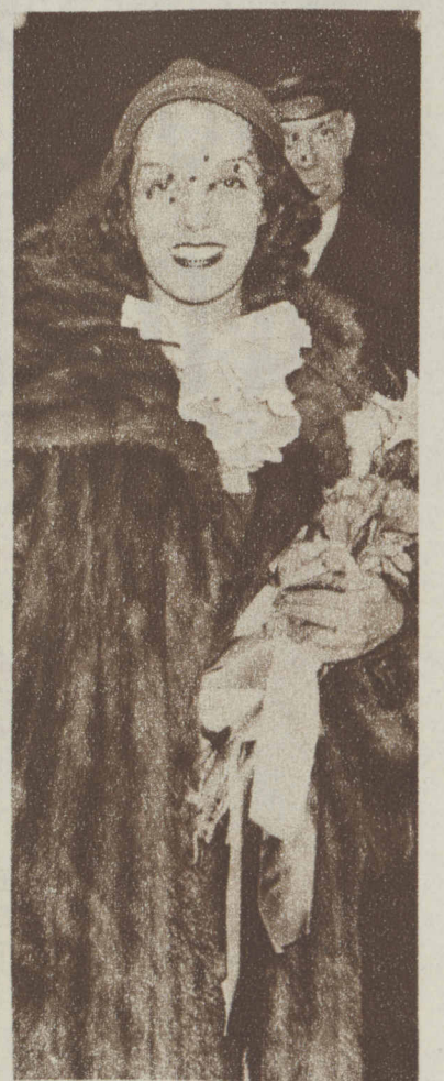
IN ENGLAND—Lupe Velez arrives at London.