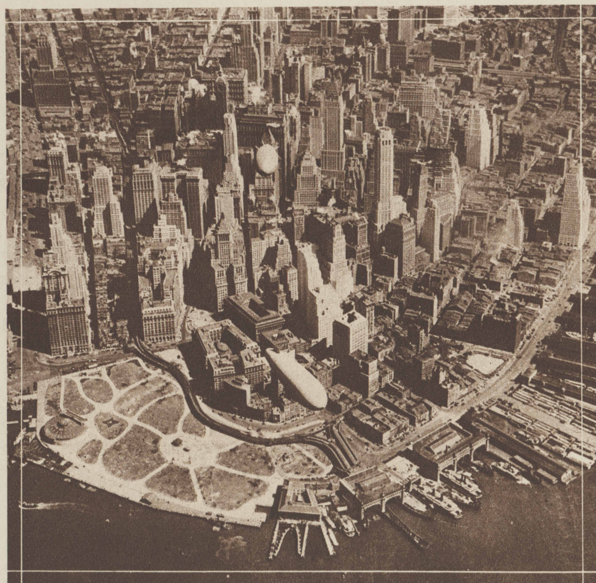
A NAVAL SQUADRON OF THE AIR PAYS A FLYING CALL ON FATHER KNICKERBOCKER—Maneuvering blimps from Lakehurst, N. J., cruise above lower Manhattan. The photograph was taken from an accompanying plane, which flew at an altitude that dwarfs the famous financial district and makes Battery park look like a private landscaped garden.

4715 South Parkway 2342 East 71st Street 1313 East 63rd Street 1136 Lake St., Oak Park Gary South Bend