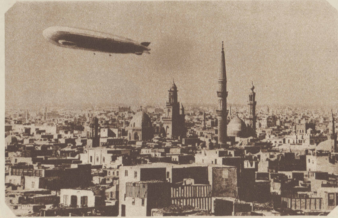
A CREATION OF MODERNITY VISITS ANTIQUITY—The German Graf Zeppelin, world-touring dirigible, flies above minarets of Cairo, Egypt, during an aerial tour of the near east.