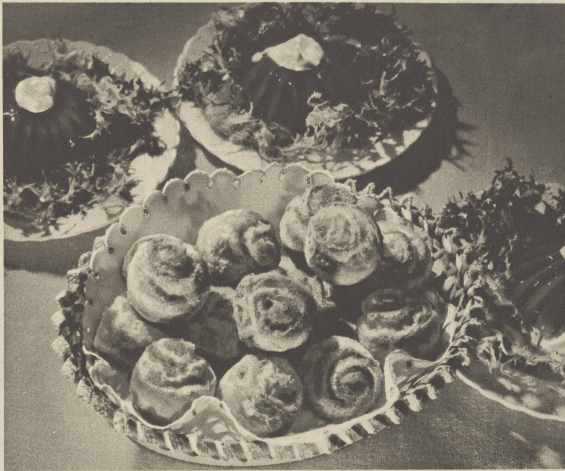
Don't these orange rolls look good? They're simple to make, too.