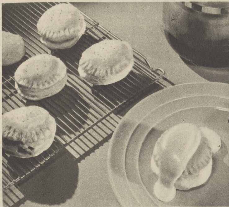
A sausage is hiding in the middle of each of these biscuits.

Sift flour, sugar, baking powder, and salt together. Cut or rub in the shortening. Beat egg, add orange juice, and add to dry ingredients. Blend with a fork until dry ingredients are moist. Turn out on a lightly floured board, knead gently for thirty seconds, and roll out into a rectangular sheet a fourth inch thick. Brush with melted butter, sprinkle with orange sugar, and roll jelly roll fashion. Cut into one-inch slices. Put each slice cut side down into a greased muffin cup. Bake in hot oven (425 degrees) for fifteen minutes. Serve hot. Orange sugar may be stored in a tightly covered jar to be used as desired. The sugar should be thoroughly mixed with orange rind.