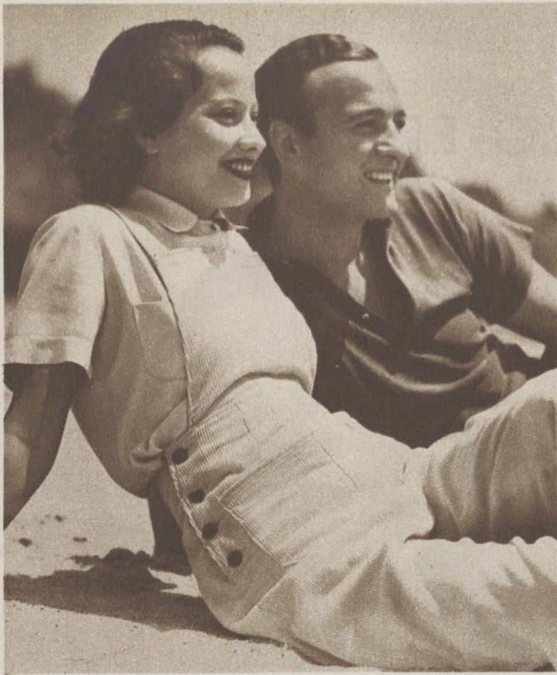
ENGLISH PLAYERS TEAMED IN HOLLYWOOD—Merle Oberon and David Niven, who appear together in a forthcoming production.

"I'm thrilled with the way your New Tangee Face Powder ends that powdery look"