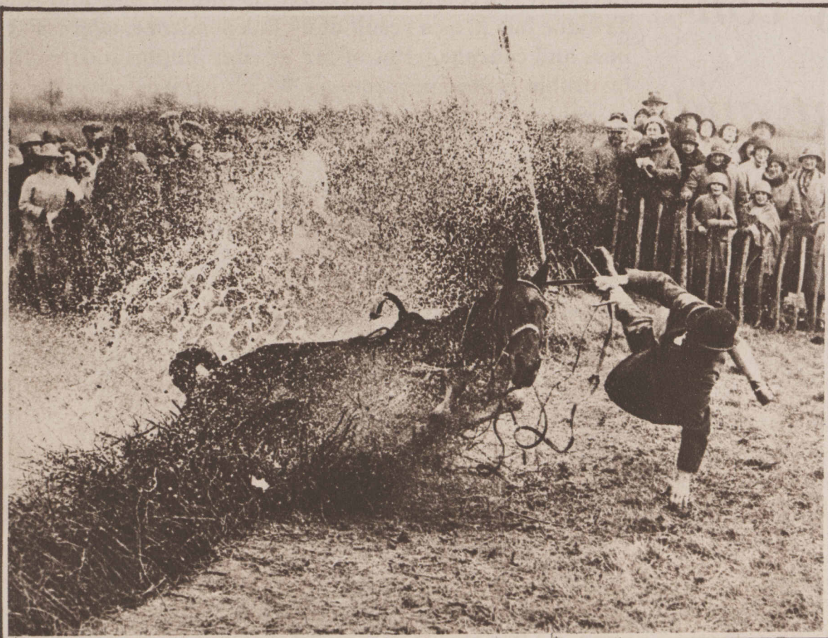
IMPROMPTU PLUNGE—S. C. Hopper's Silver Idol comes a cropper at the water hazard during the recent society horse and stock show at Lechlade, England.

125 SOUTH STATE STREET 4700 Sheridan Rd. 2342 East 71st St. 4052 W. Madison St. 1313 East 63d St. 6440 So. Halsted St. 607 Davis St., EVANSTON 1136 Lake St., OAK PARK Rockford Elgin Gary South Bend