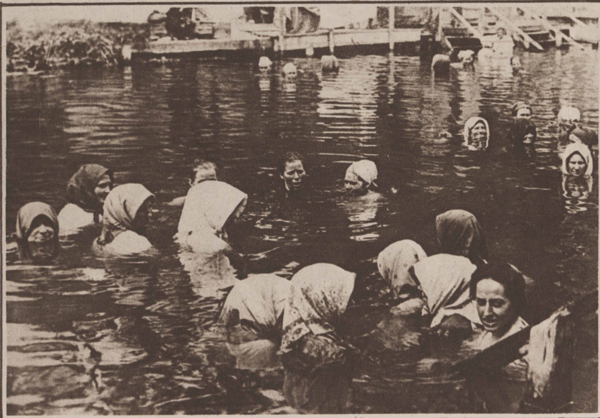
THEY DON'T HANG THEIR CLOTHES ON A HICKORY LIMB at Haviz, Hungary, but, fully dressed, even to the head shawls, take their plunges in the town pool.

THREE genuine old master photographs, size 8x10 inches, at the Special Price of $2.85 Regular $10 Value Gibson 58 E. Washington St. Open Sunday 10 to 4 P. M. Telephone Central 3982 Present this ad at time of sitting