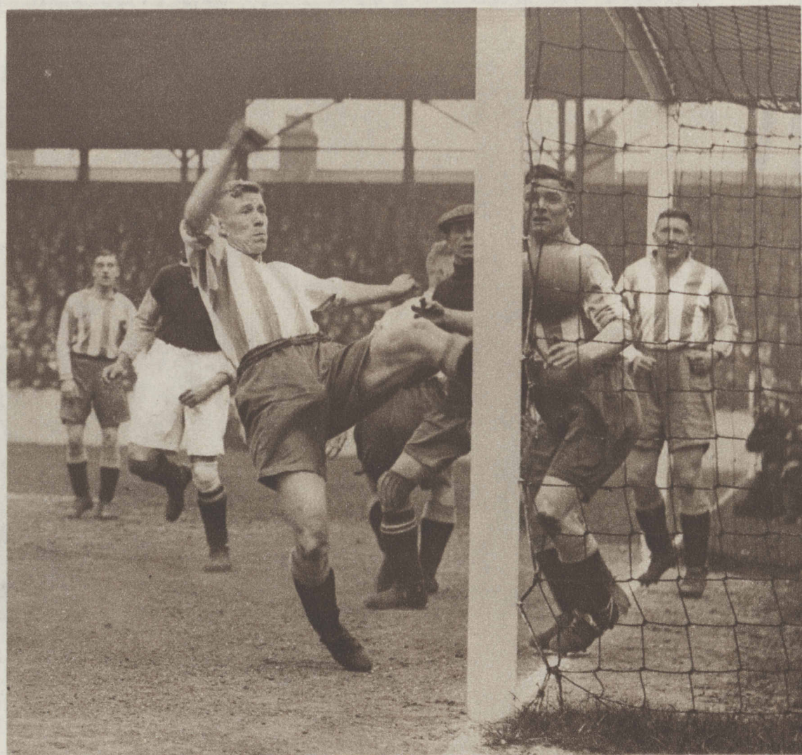
MAKING A GOAL in a soccer game in London.