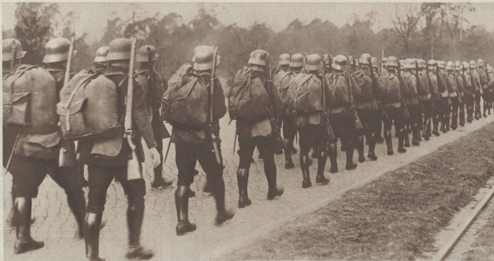
FOR THE FIRST TIME since the world war German troops march with full pack in a drill at the Berlin tiergarten sportplatz.