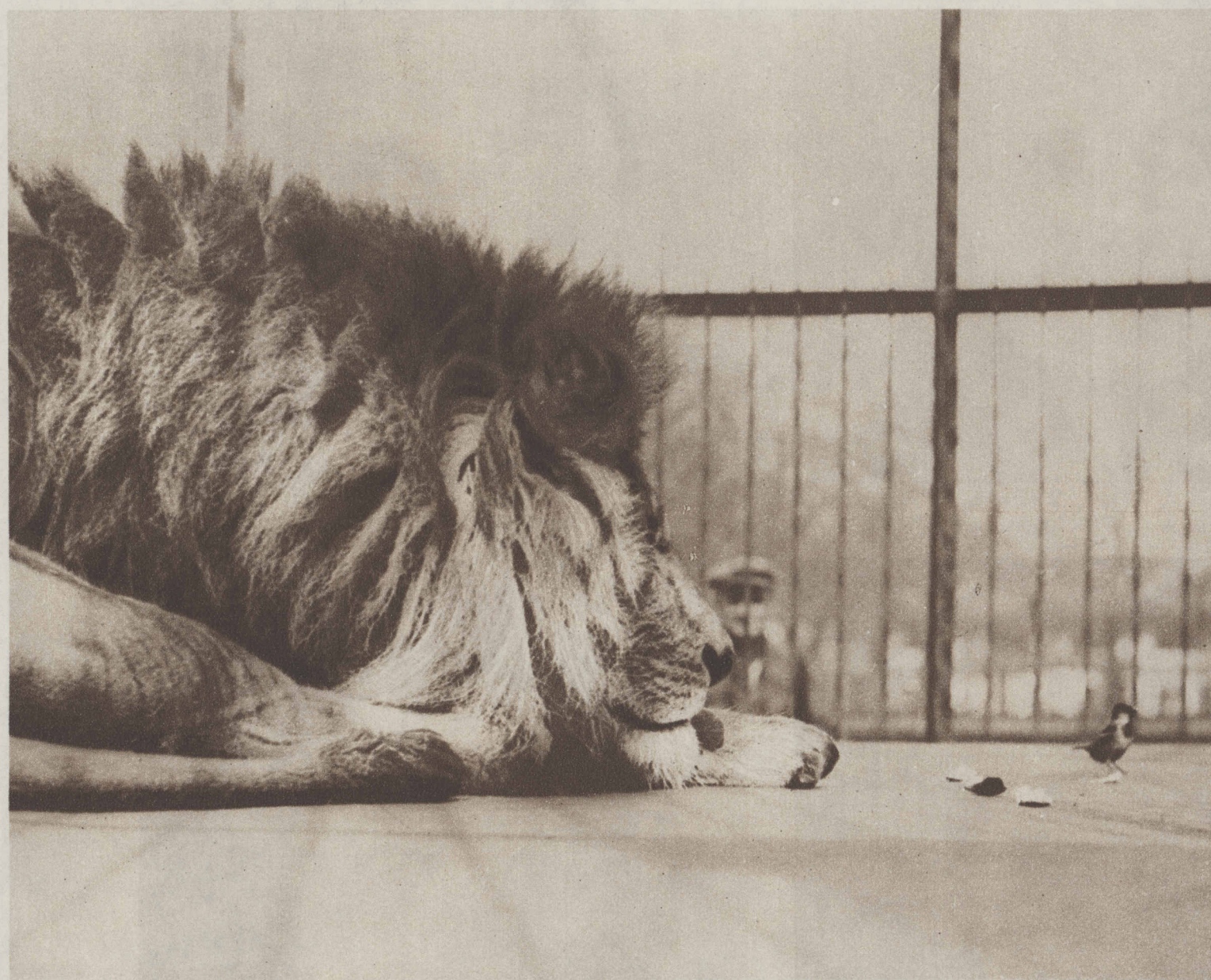
A BRAVE SPARROW filches a bite of lunch from the lion in the London zoo.