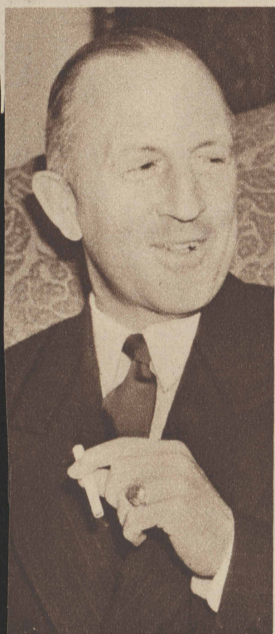
GOV. LLOYD C. STARK OF MISSOURI.