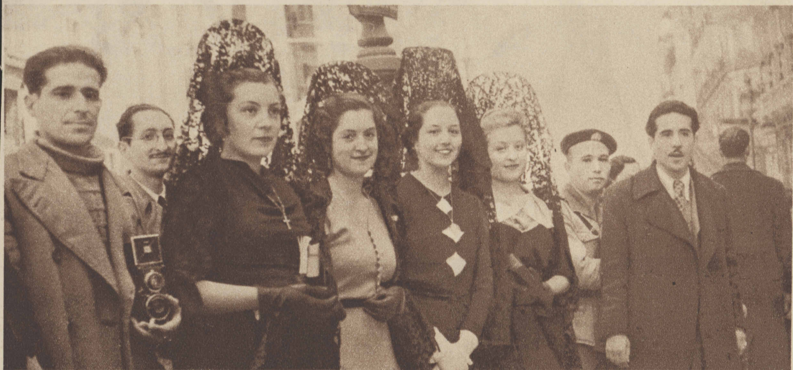
POSTWAR MADRID.