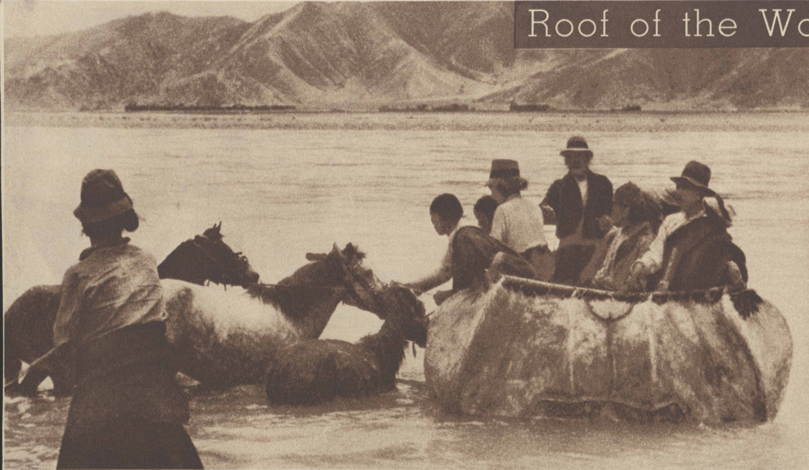
TIBETAN YAK-SKIN FERRY.