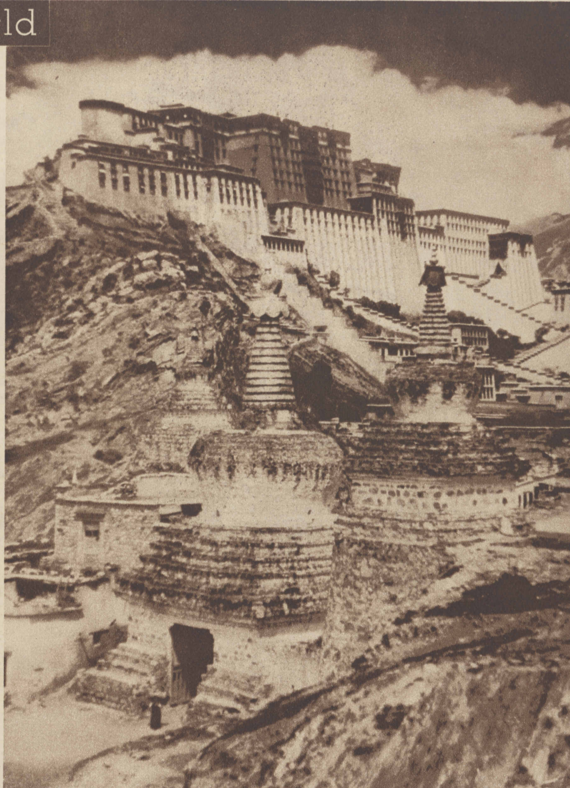
PALACE OF THE DALAI-LAMA, LASSA.