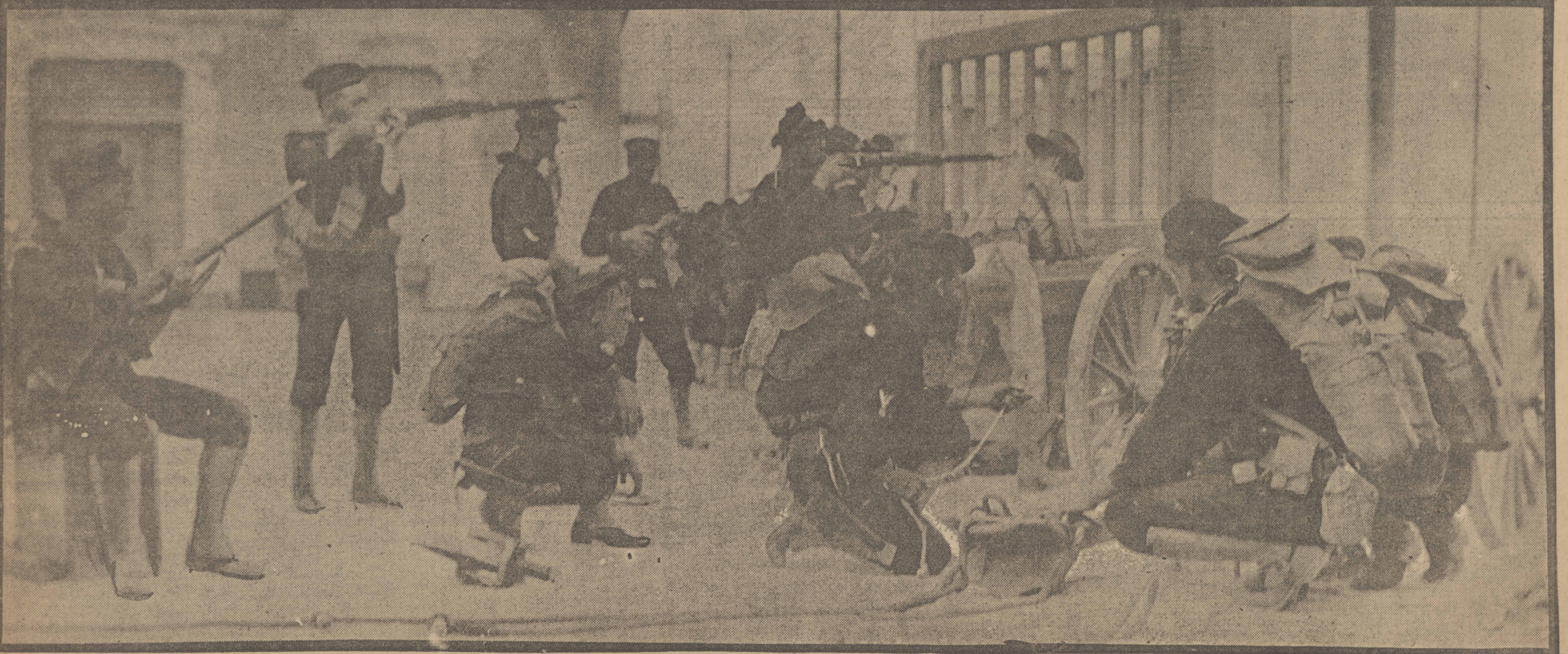
TOP PICTURE—Sailors and Marines bringing ashore ammunition and supplies . . . MIDDLE PICTURE—Bluejackets dragging quick firing gun to firing lines . . . LOWER PICTURE—Bluejackets with rifles picking off snipers, and quick-fire gun crew waiting for right moment to fire.