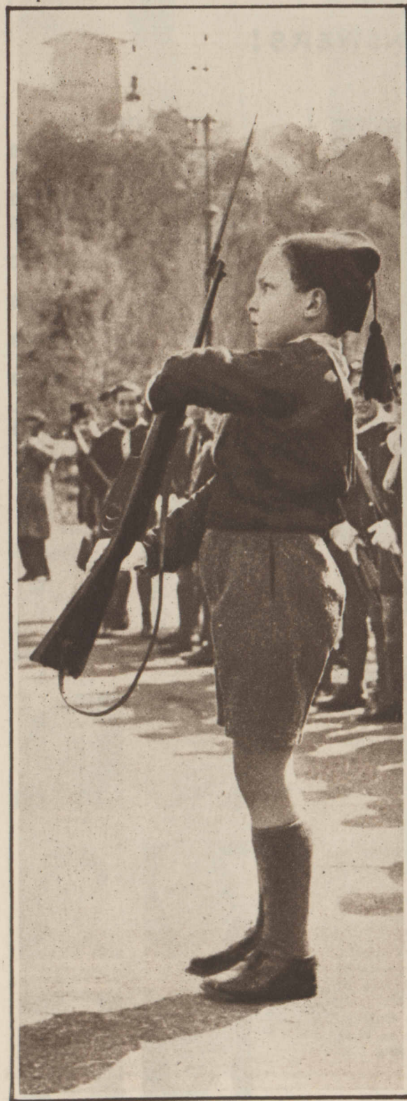
A TEN-YEAR-OLD in Mussolini's Balilla, or young Fascists' army, saluting the duce during a recent review.