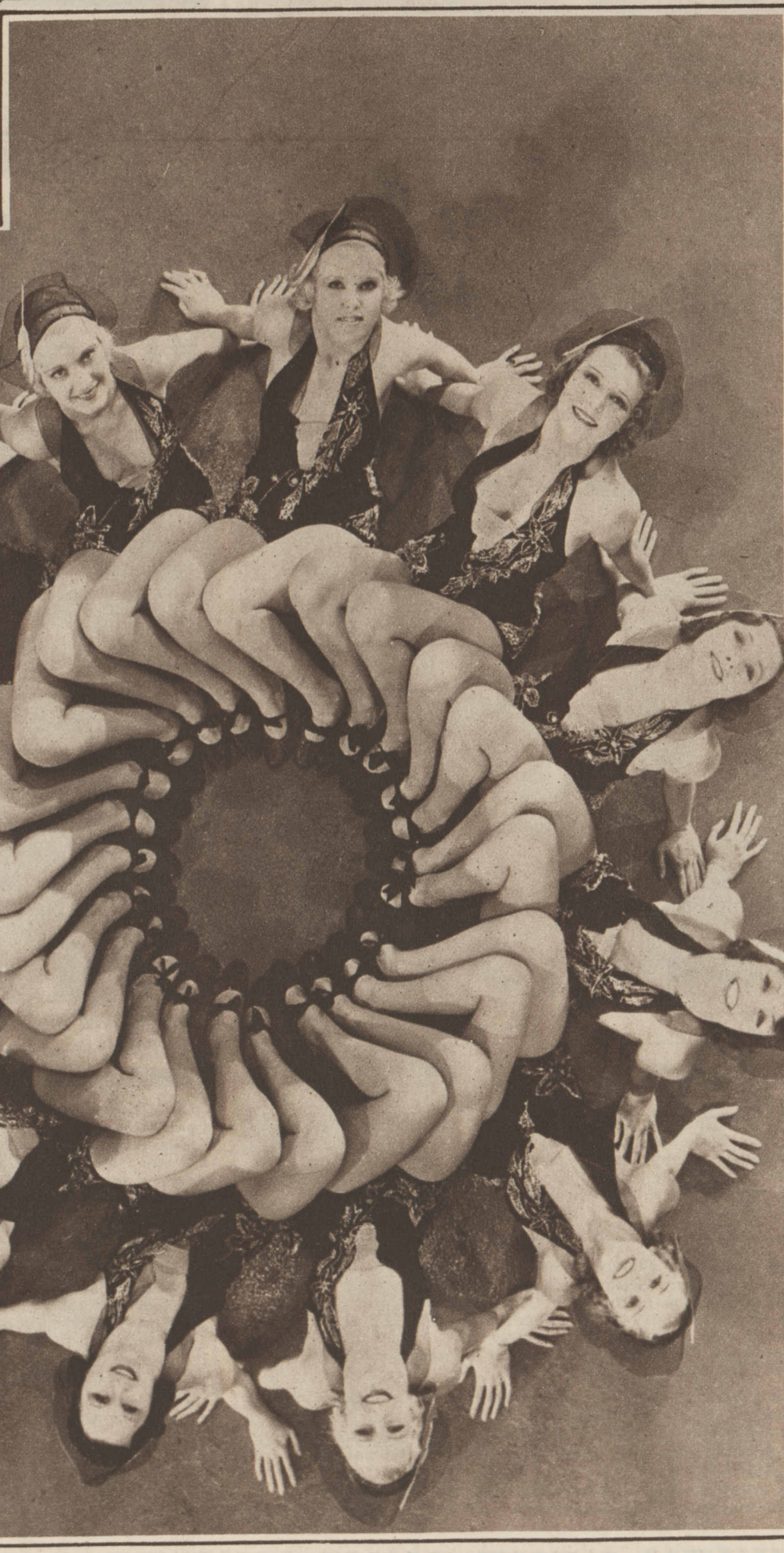
CONCENTRIC PULCHRITUDE —Ladies of the chorus of a Hollywood revue posed for this symmetrical design pictured by a cameraman from his lofty perch on the studio's traveling crane.