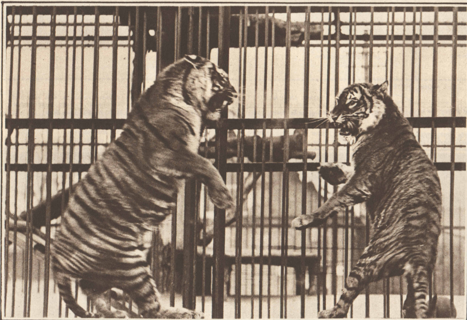
OUR MR. PEGLER could find no fault with this boxing match. No boxing commission fixed the rules; no soulless corporation officiated at the gate; no purse rewarded the contenders. These nine-month-old twin tiger cubs, presented to the London zoo by the Nawab Sahib Bahadur Bahawalpur of Punjab, India, started the sparring match as soon as they were placed in their cage in the lion and tiger house at the zoo.