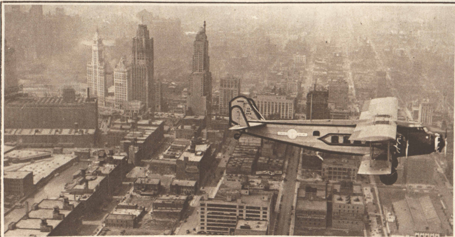
A CHICAGO-SAN FRANCISCO AIR EXPRESS circles over Chicago on the start of its transcontinental flight. Before straightening out for its nonstop flight to Cheyenne, Wyo., where the operating personnel is changed, this fourteen passenger air liner flew over the near north side. In the left foreground are the Wrigley building, Tribune Tower, and Medinah Athletic club.