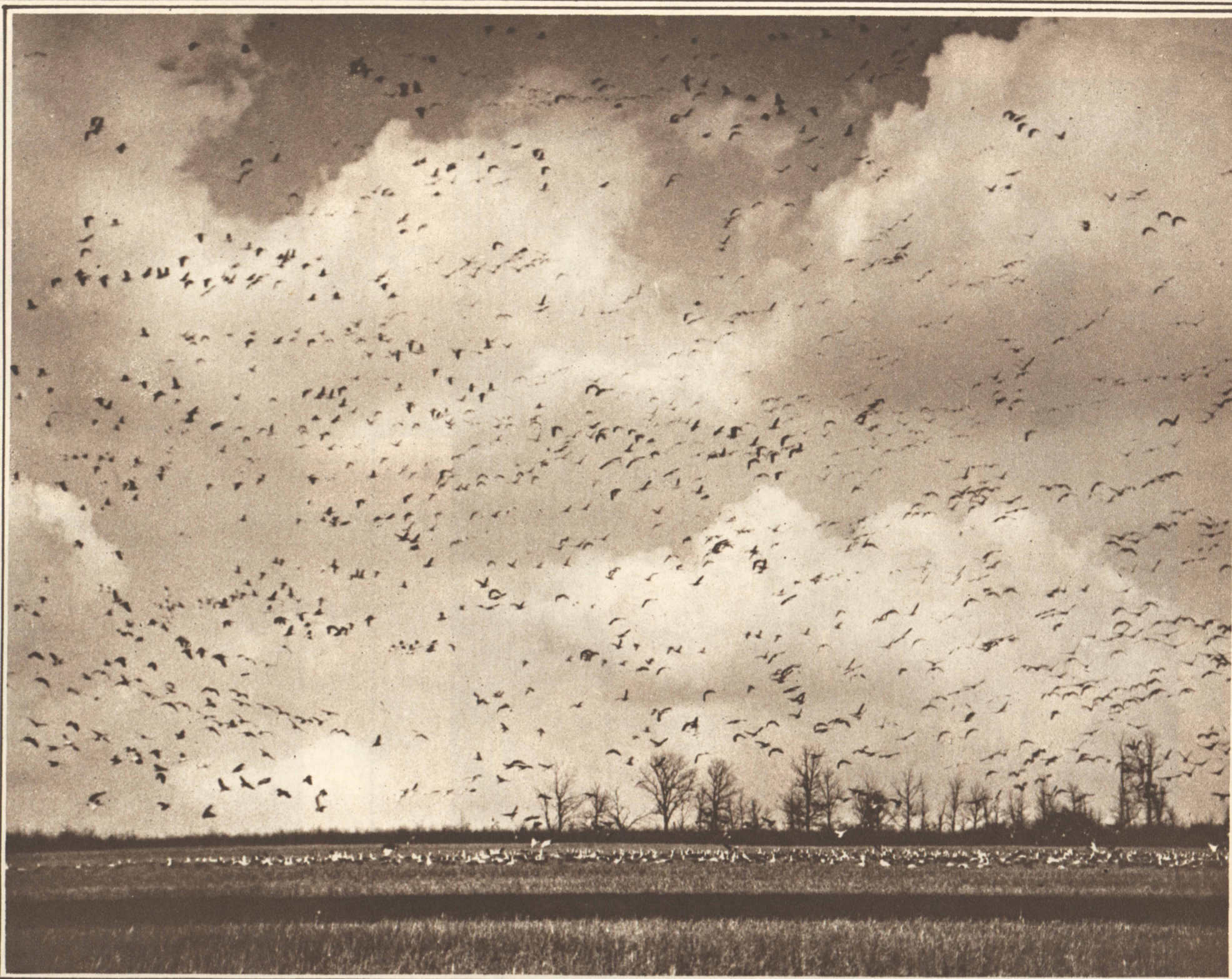
AT THEIR SOLE STOPPING PLACE BETWEEN LOUISIANA AND BAFFIN LAND these vast flights of blue and lesser snow geese were pictured from a blind with a telescopic camera. Each year in April they leave the bayous and marshes of the south for the arctic wastes, stopping for ten days to rest and feed in the stubble fields twenty miles west of Winnipeg, Man. It is estimated that 500,000 geese visit these fields during the northward migration.