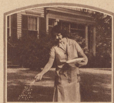
So clean, odorless, can be sown by hand.

For Vigoro is a scientific, complete plant food, different from any other you have ever known, perfected by