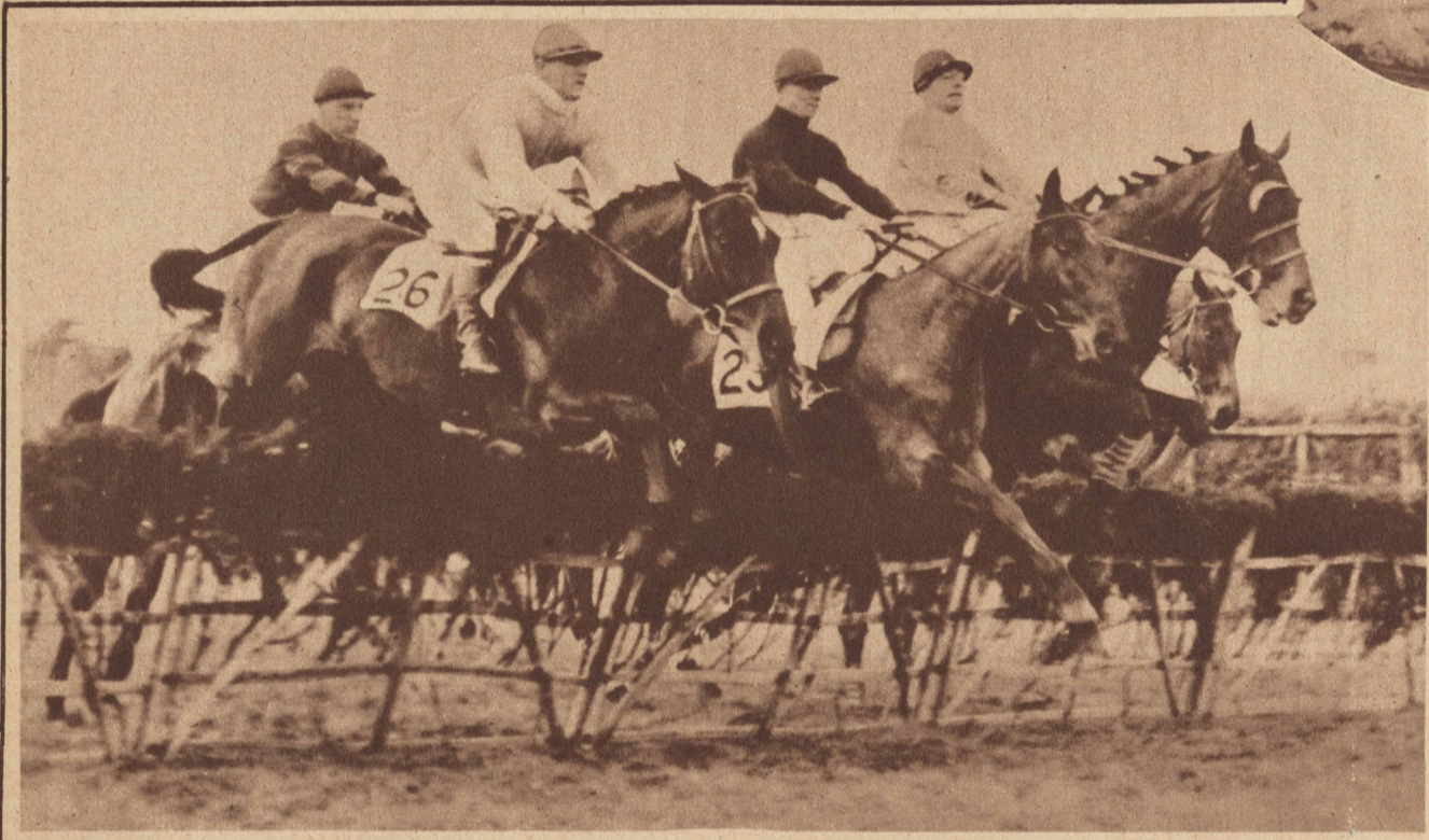
NECK AND NECK IN THE AIR—Over a barrier together, with none too much space between them, riders in a steeplechase on a London course provide breath-taking action and thrill.