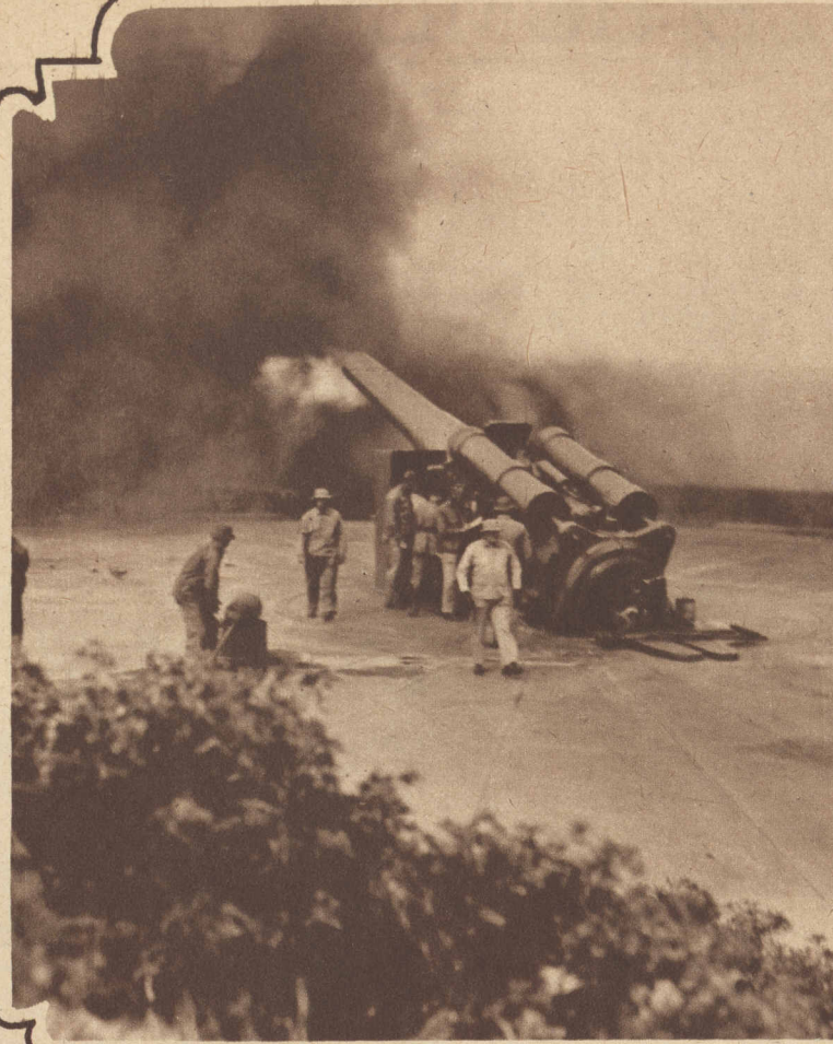
THEY DEFEND THE GOLDEN GATE —In times of peace the members of the Sixth United States artillery, stationed at Fort Barry, Cal., prepare for war. They held target practice with 12 inch, long range guns recently and scored excellent records. Here, in these views of one of the Big Berthas, is a crew in action.