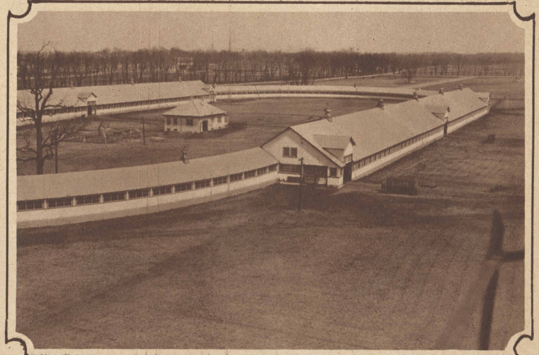
LUXURY FOR BLUEBLOODS OF THE TURF —Harry Sinclair's Rancocas racing stables farm at Jobstown, N. J., boasts of the world's largest indoor training track. The course is three-eighths of a mile long and 18 feet wide. Covering 1,244 acres, with ninety miles of fences, the farm boards and rooms 300 horses and turns out some of the fastest steppers of the country. Rumor had it recently that the oil millionaire would sell his stables and retire from the turf.