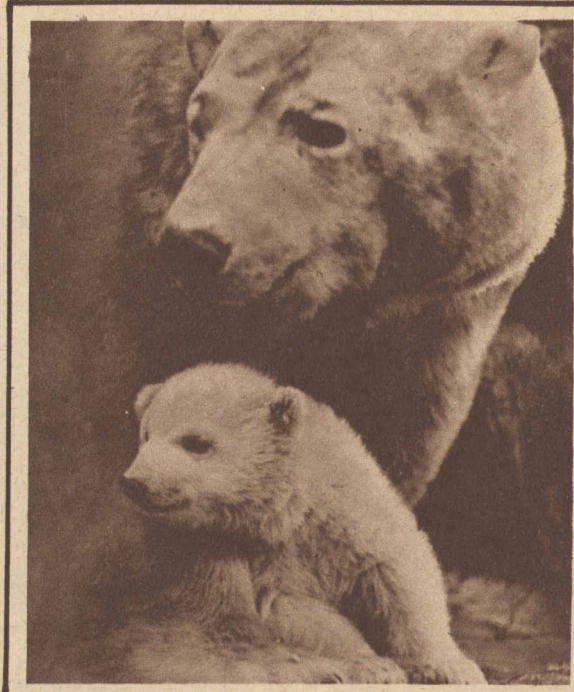
WE CAN'T TOUCH THE CUB for fear its mother will kill it, said the director of the Washington park zoo at Milwaukee. So the offspring was more than 14 weeks old before the officials knew whether a male or female had been added to their zoo.