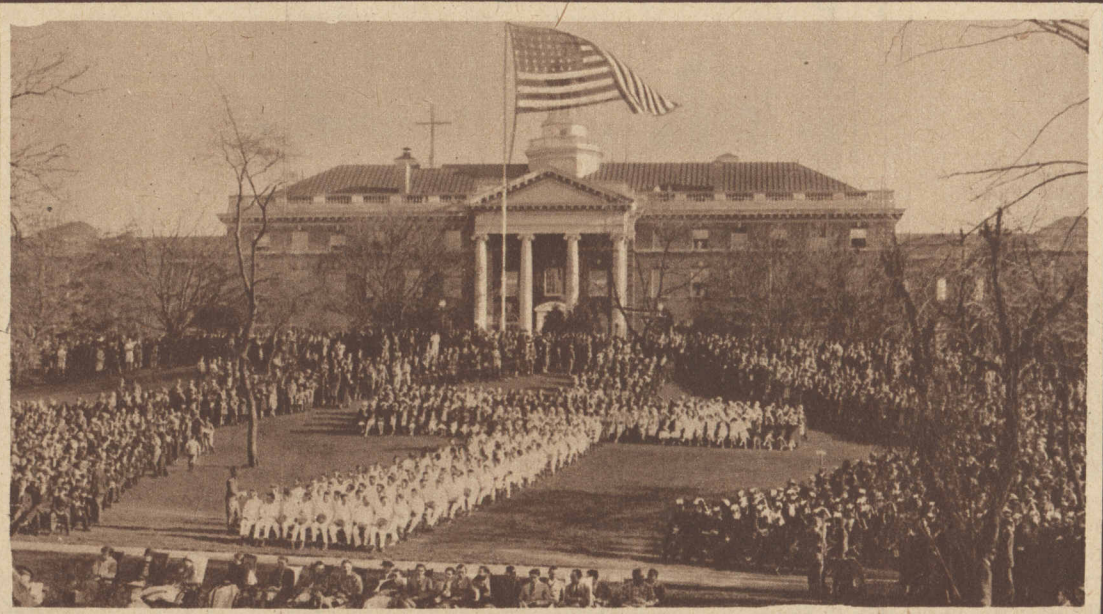
A LIVING CROSS GREETES THE SUNRISE at Walter Reed hospital in Washington, 500 uniformed Red Cross workers, army nurses, and men from the army medical department forming the design of red and white. Ten thousand spectators witnessed the spectacle and joined in this religious ceremony at the hospital.