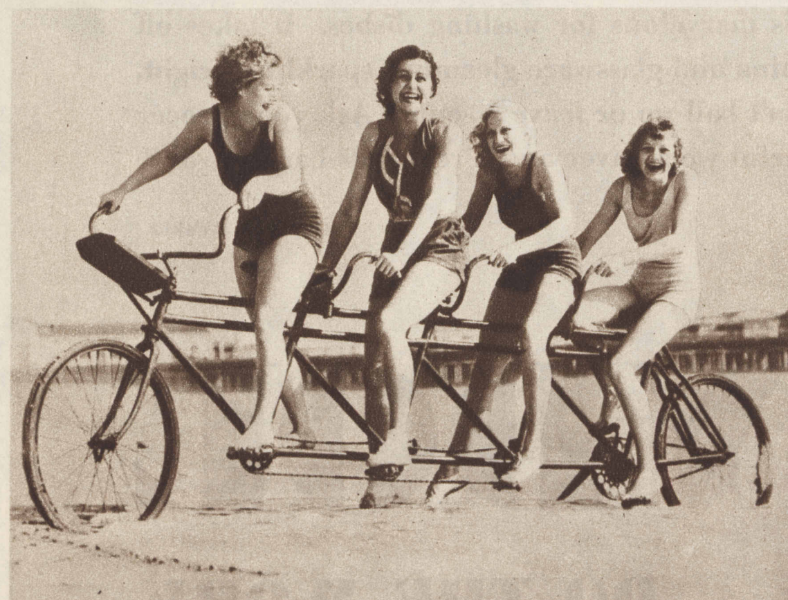
AN ANCIENT "QUAD" resurrected for a ride along the beach.