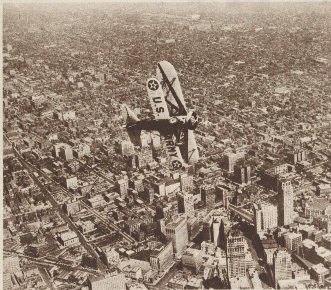
AN ARMY PURSUIT PLANE wheels high over Detroit.