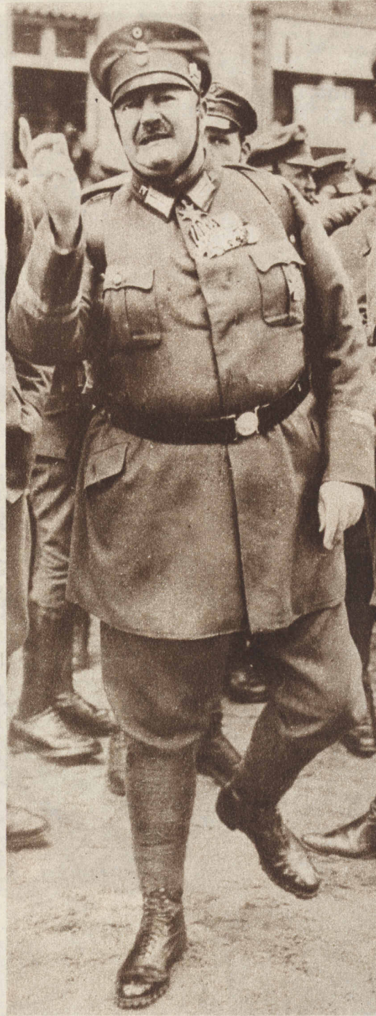
STUDIES IN EXPRESSION—At the right, Eitel Friedrich, son of the former kaiser; above, Hitler with the former crown prince.