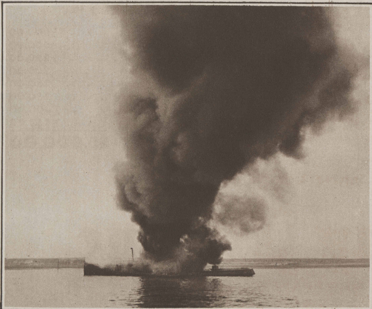
AN OIL TANKER AFIRE —Six hours after a fire caused by an explosion aboard the tanker Stuart had been extinguished a second explosion took place. This picture, taken just after the second disaster to the craft at Tremely, N. J., shows the pillar of smoke rising from the doomed vessel.