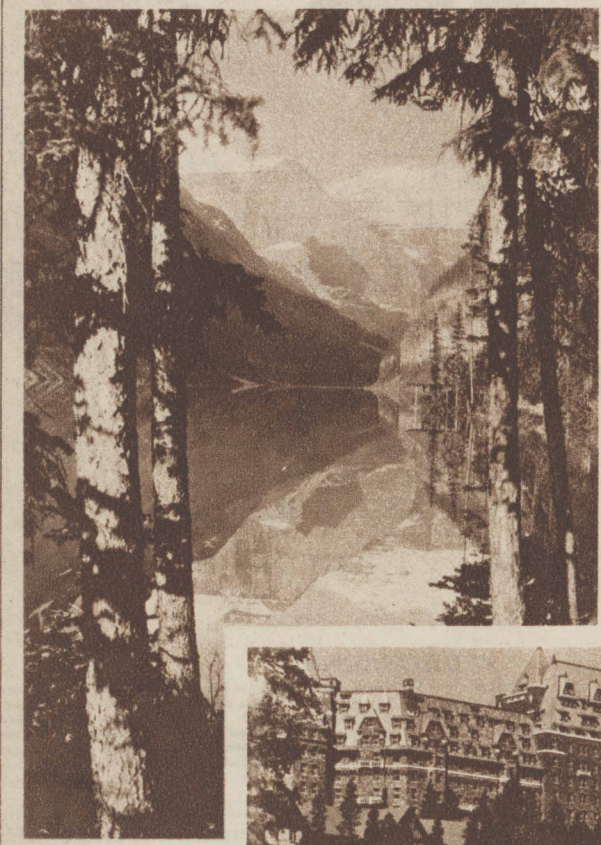
GOOD EITHER WAY—The splendor of snow-peak mountains mirrored by lovely Lake Louise. The Chateau Lake Louise is only forty smooth miles by motor from Banff Springs Hotel.

Phone Monroe 3090 or write for FREE BOOK—shows Model Rooms, 52 rugs in colors; quotes Lowest Prices in years; gives TRIAL OFFER; and Guarantee of Satisfaction or money back. Visit Our Nearest Show Rooms OLSON RUG CO. DEPT. N-2 1500 Monroe St. 2800 N. Crawford 6032 So. Halsted 4532 Broadway (152 W. Wisconsin Ave., Milwaukee, Wisc.)