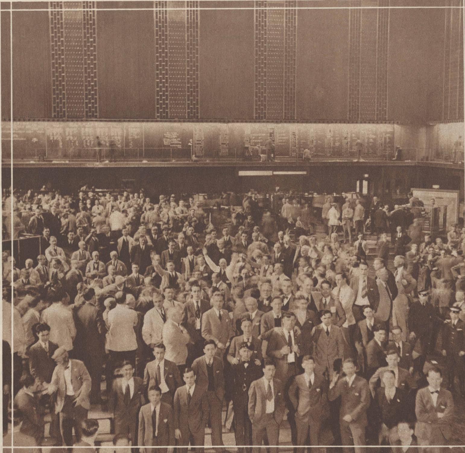
IN THE WORLD'S BIGGEST GRAIN EXCHANGE—An action scene on the main trading floor of the Chicago Board of Trade. At the far right hand corner is the new location on the floor of the securities market, recently moved from other quarters.