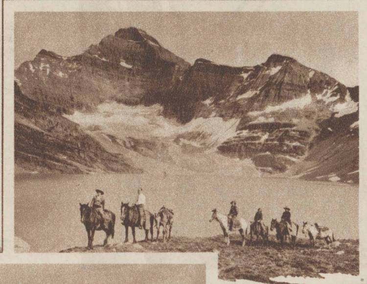
NO TREES FOR HITCHING-POSTS—Lake McArthur, 1,000 feet above timber line near Lake O'Hara, accessible by motor and mountain trail from Banff Springs Hotel, or pony trail from Chateau Lake Louise.