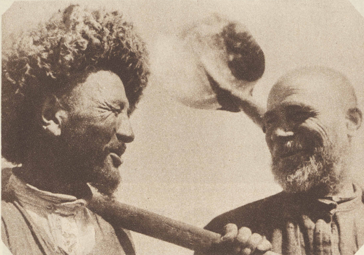
DISCIPLES OF THE FIVE-YEAR PLAN—A character study from one of the collective farms of soviet Russia. These laborers are representatives of one of the types met in sovietland by Henry Wales, Tribune correspondent, whose revealing articles on Russia are appearing daily.