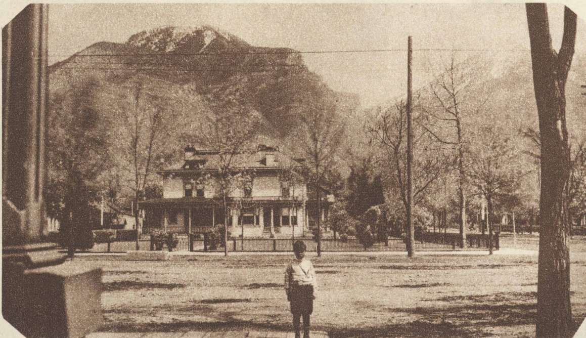
A SLEEPING BUDDHA IN THE HILLS—Like the reclining figure of a Gargantuan idol, a great stone face presents its curious outline to view in the heights above Provo, Utah.