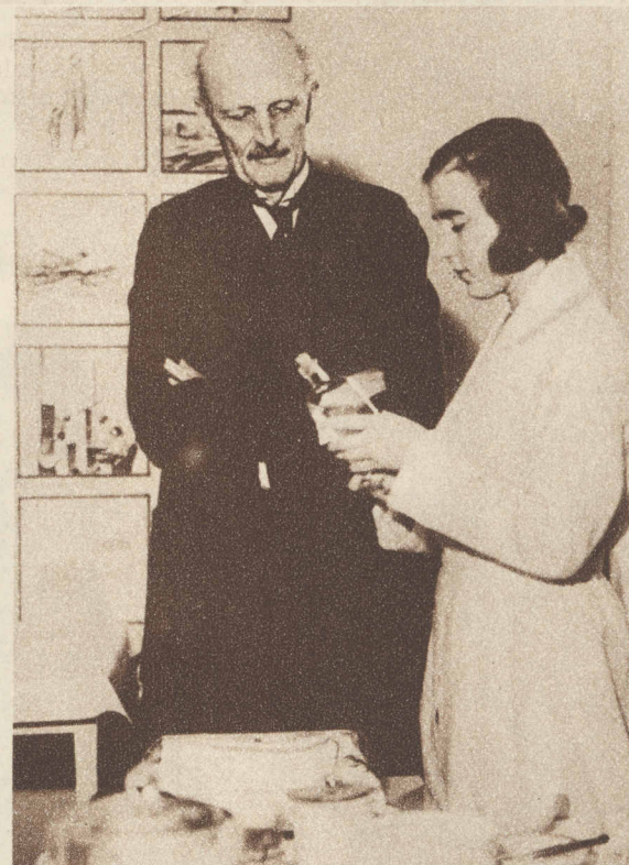
A ROYAL NURSE—Princess Ingrid, daughter of the crown prince of Sweden, works under the eye of her uncle, Prince Carl, president of the Swedish Red Cross.