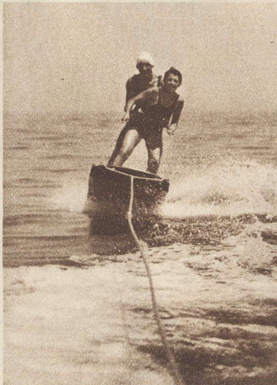
INTO THE FOAMING SURF two aquaplane riders whiz at Catalina island; there'll be bigger and better excitement in a moment, when the slack comes out of the rope.