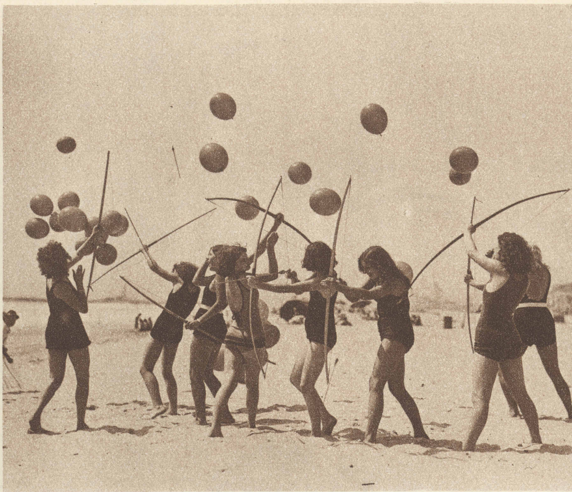
A BATTALION OF THE BEACH reverts to archery for a novel contest at Long Beach, Cal.; the idea is to release toy balloons and to shoot them down before they float out of bowshot.

SOLD BY GOOD CLOTHIERS IN EVERY CITY AND TOWN COHEN, GOLDMAN & CO. 45 WEST 18th STREET, N. Y. C.