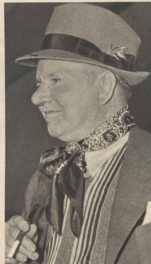
As a spectator at a movie rehearsal.