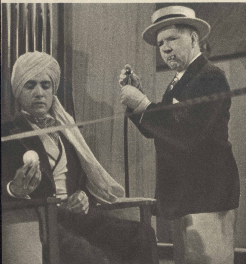
His stage sketches developed from mishaps with billiard balls.