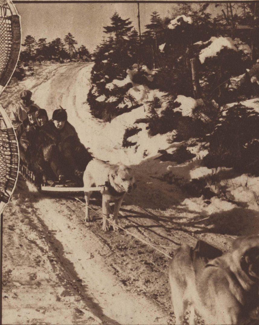
③ WILDERNESS PULLMAN. Coming through the bush by dogsled. It's a thrilling ride downhill, but on a steep upgrade you get off and walk!