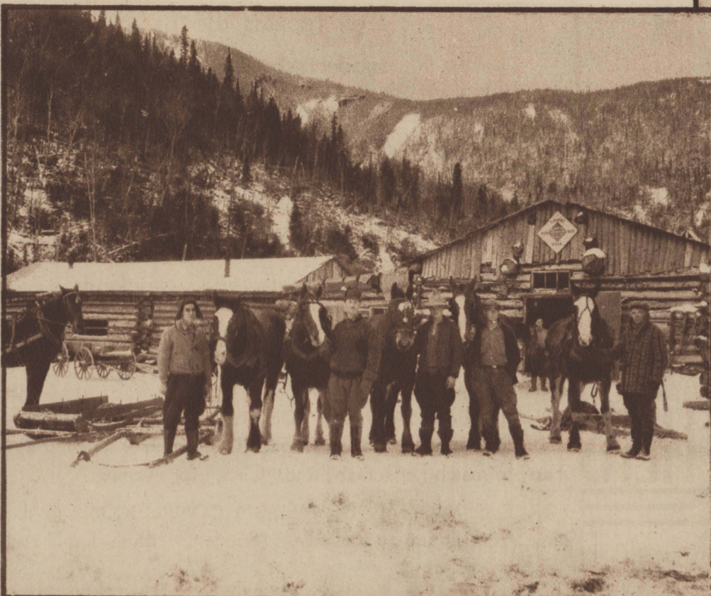
④ TIMBERLAND HORSES AND THE MEN WHO HANDLE THEM. The horse is regarded as the unit of production in the wilderness, and supplies for the season are figured on the basis of one horse to three men. Such a quartet will account for a square mile of timberland during the cutting season.