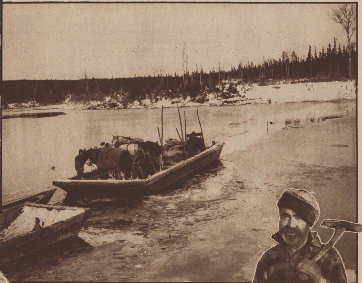
① TRANSPORTATION "a la Shelter Bay." Above, a load of supplies arrives at a wilderness camp. In the picture below is a primitive ferry in operation in the Tribune timberlands. A load of horses are being ferried over the Rocky river. A steel cable has been stretched from shore to shore and human brawn supplies the power.

ON THIS page we see the primitive types of transportation that exist in the wilderness that provides the paper on which your Tribune is printed. W-G-N tonight will tell you the story contained in these pictures, describing the thrills of a ride with the dogs, and how the Tribune transports supplies and provisions for the thousands of lumberjacks who cut Tribune pulpwood.