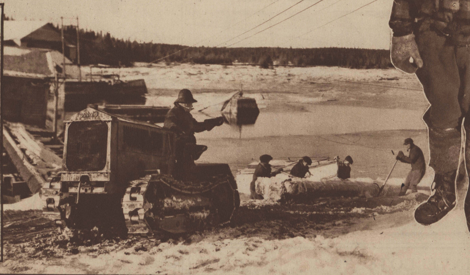
⑤ A MODERN NOTE. Caterpillar tractors at work on the shores of the Rocky river in Shelter Bay. Tractors have been introduced in the wilderness by the Tribune.