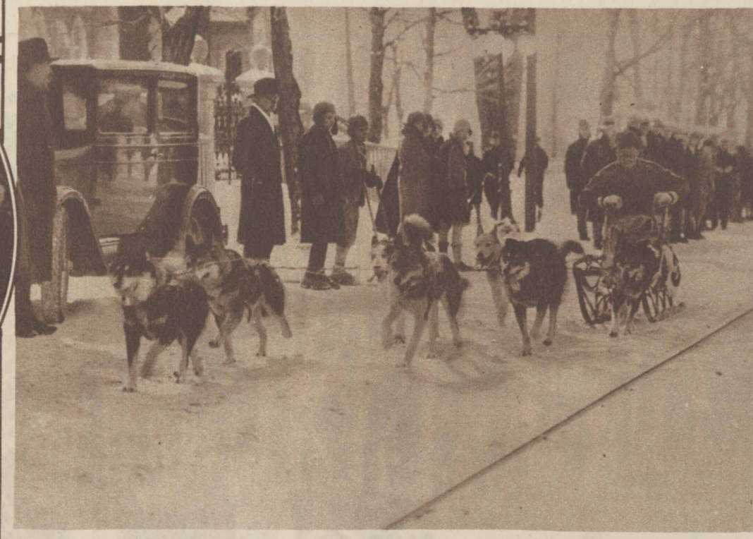
UNDER THE WIRE FOR THE TROPHY—Leonard Seppala, Alaska musher, won the seventh international dog derby at Quebec, and in doing so broke the course record by one hour. The gruelling race was over 123 miles of snow.