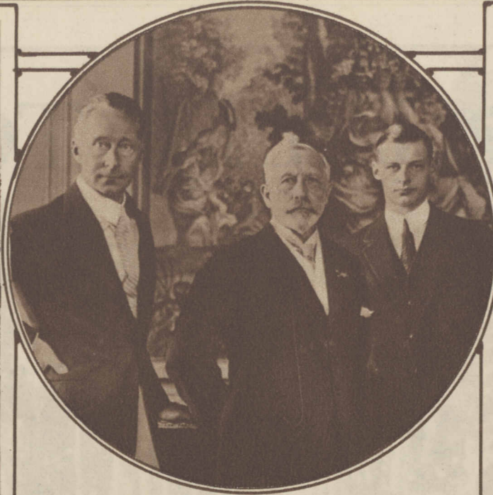
• THREE WILHELMS, pictured at Doorn. With the former kaiser were his son, the former crown prince, and the latter's son, the two who would be in the line of succession were the ex-kaiser still in power.