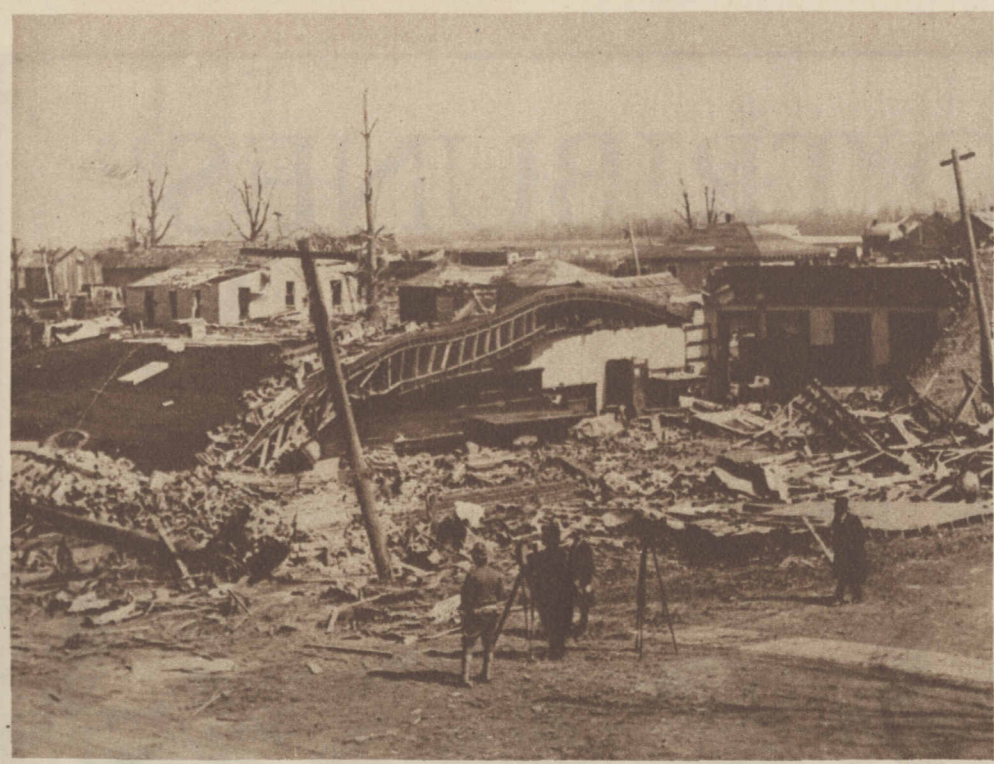
IN THE WAKE OF A TORNADO—A score of persons were killed, and huge property damage was suffered, when a terrific storm struck the village of Duncan, Miss. This gives some idea of the destruction.