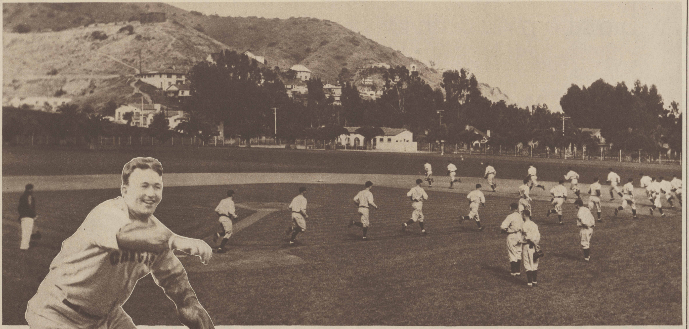
HITTING THE ROUND TRIP TRAIL ON CATALINA ISLAND —The National league champions of 1929, Chicago's Cubs, rehearse for an act that the home town hopes to see again early next fall—with a slight variation in results. Spring training in California, as this idyllic panorama indicates, is something below zero in hardships.