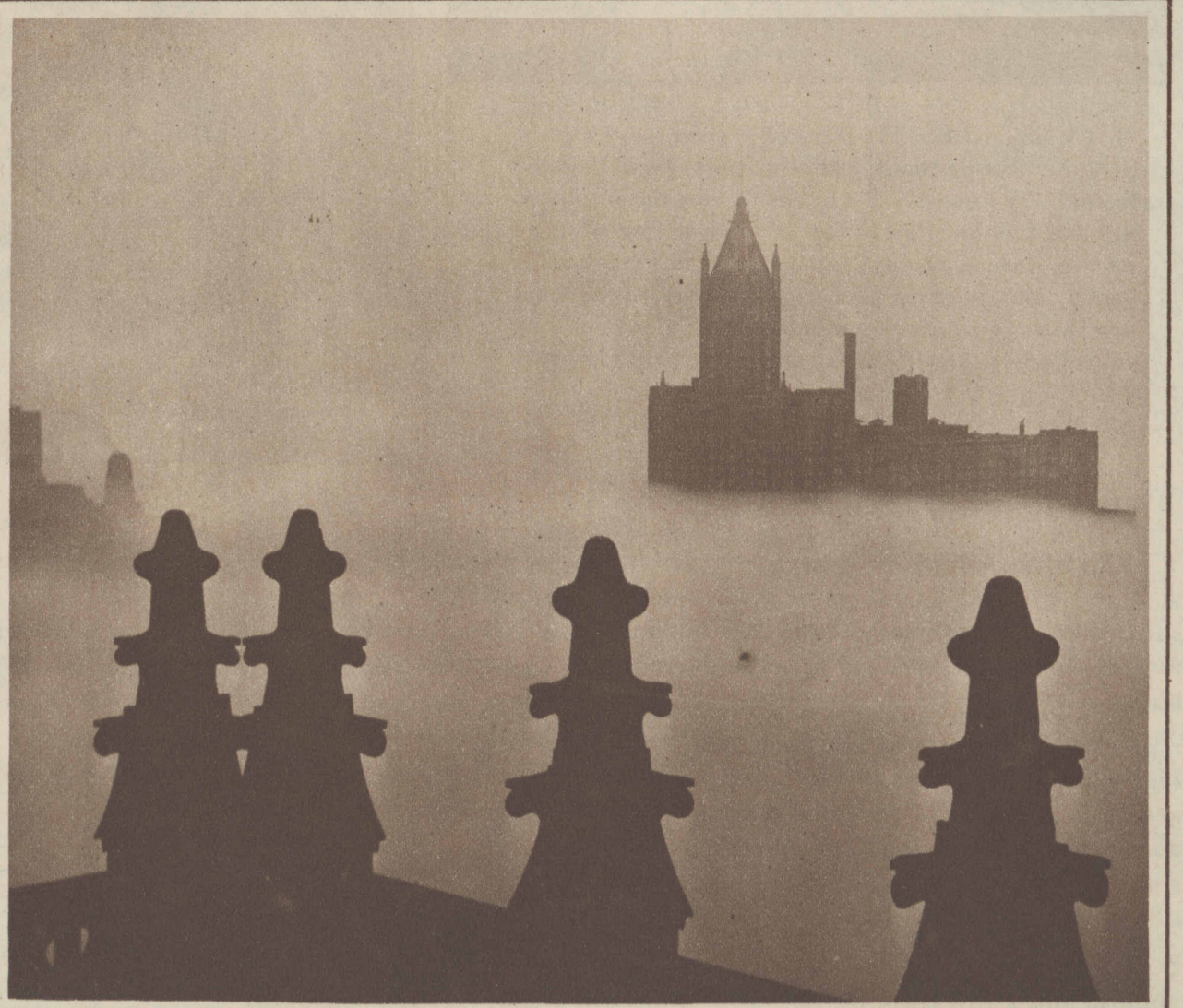
COMING UP FOR AIR , it is presumed, the stately outline of the Furniture Mart pushes its towering extremities above the bank of a dense Chicago fog. The camera, scanning the upper surface of the fog from Tribune tower, found this isolated structure looming before it to the eastward.