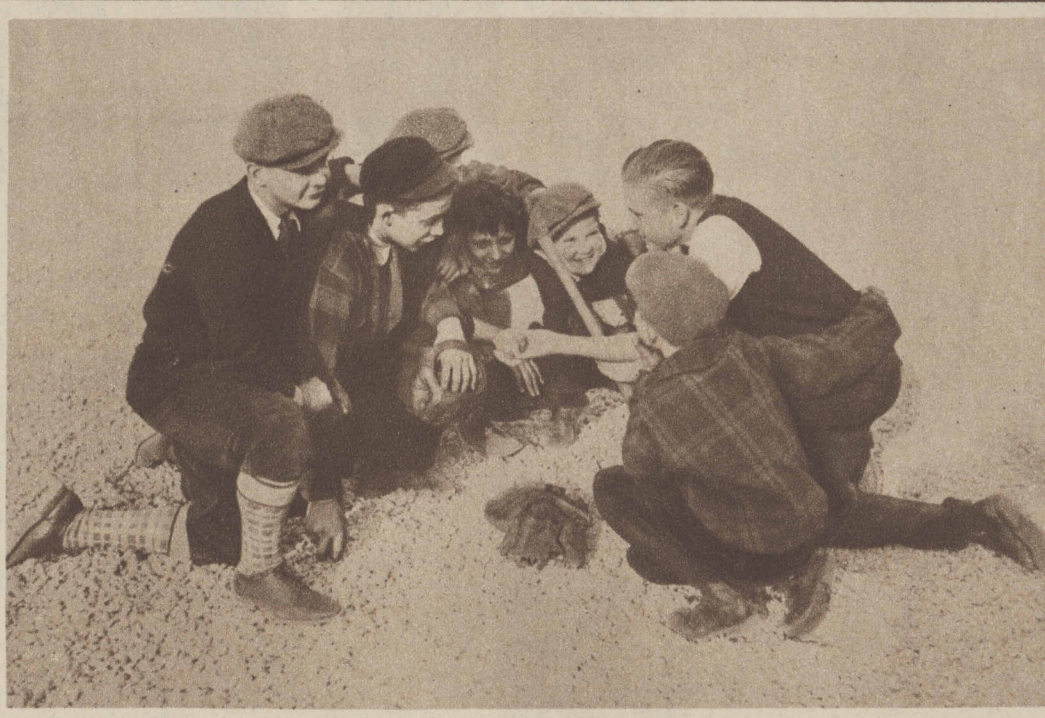
ADD HERALDS OF SPRING —Opposing no resistance whatever to the temptation of warm, sunny days, the "Junior Wolves" brew strategy for the season's baseball campaign at Ashland boulevard and Leland avenue.