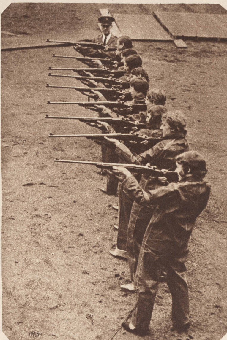
STRAIGHT THINKING AMONG MODERN CO-EDS —The varsity girls' rifle squad at the University of Pennsylvania trains intensively for impending matches.