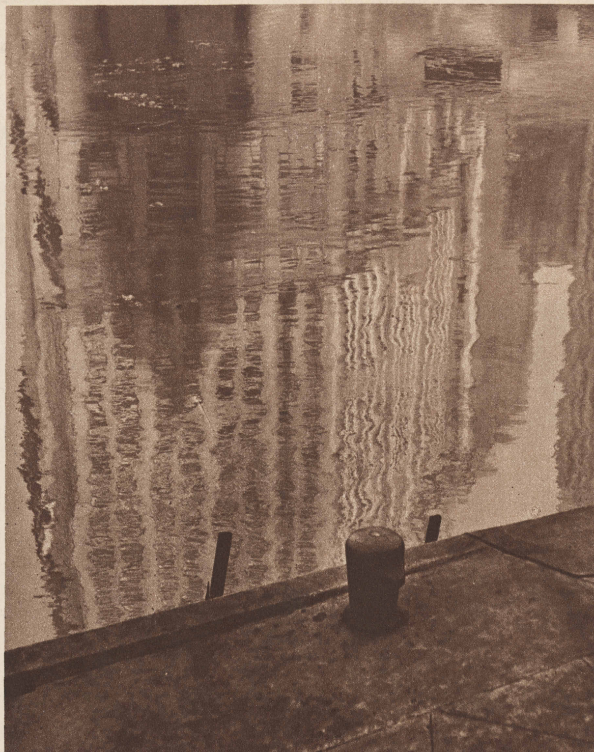
REFLECTIONS ON SKYSCRAPERS —Odd patterns are drawn on the surface of the Chicago river by shadows of buildings near the north approach to the Michigan avenue bridge. The Wrigley building casts the bulk of the shadow; Tribune Tower is reflected in part at the right.