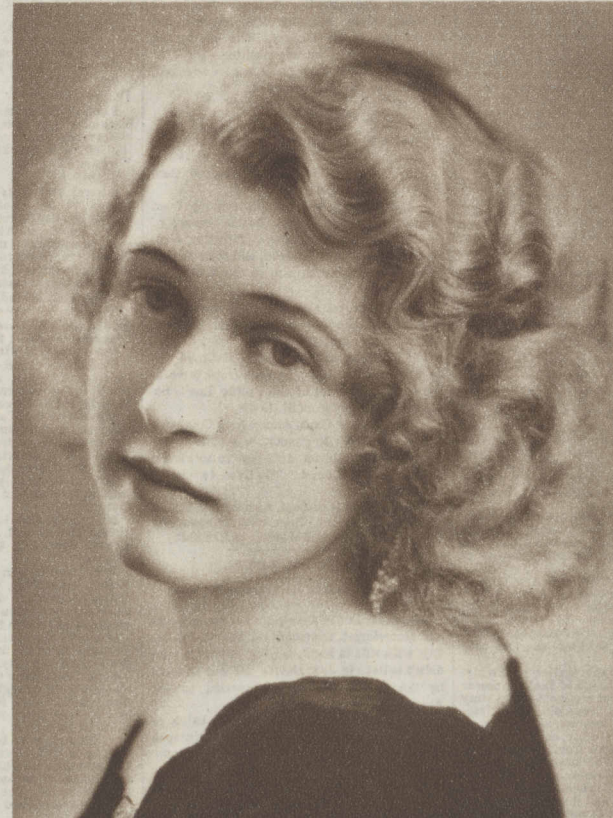
L. F. Antigo, Wis.

5. Beginning Sunday, January 29th, and continuing for ten consecutive Sundays, ten of the photographs submitted will be published each Sunday in the Picture Section of the Chicago Sunday Tribune, and to each girl whose photograph is so published the Chicago Tribune will pay the sum of $100.00. (Total $10,000.00.) These prizes are in addition to the Grand Prizes. Every girl whose photograph is submitted, whether published in the Tribune or not, will be eligible for the Grand Prizes.