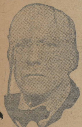
HENRY M. HYDE.