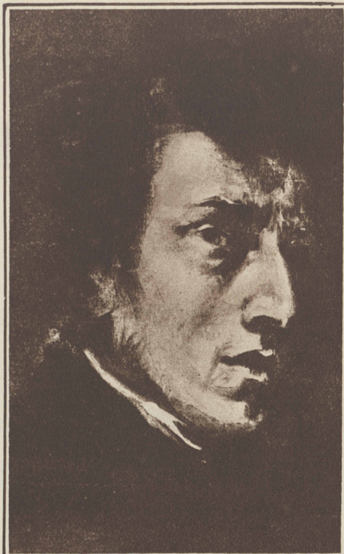
ONE HUNDRED YEARS AGO, at the age of twenty-two, Frederic Francois Chopin, the great Polish musician, came to Paris from his beloved native land, then suffering its "partition" at the hands of Russia. Today the French capital celebrates the centenary of the arrival of its distinguished adopted son.