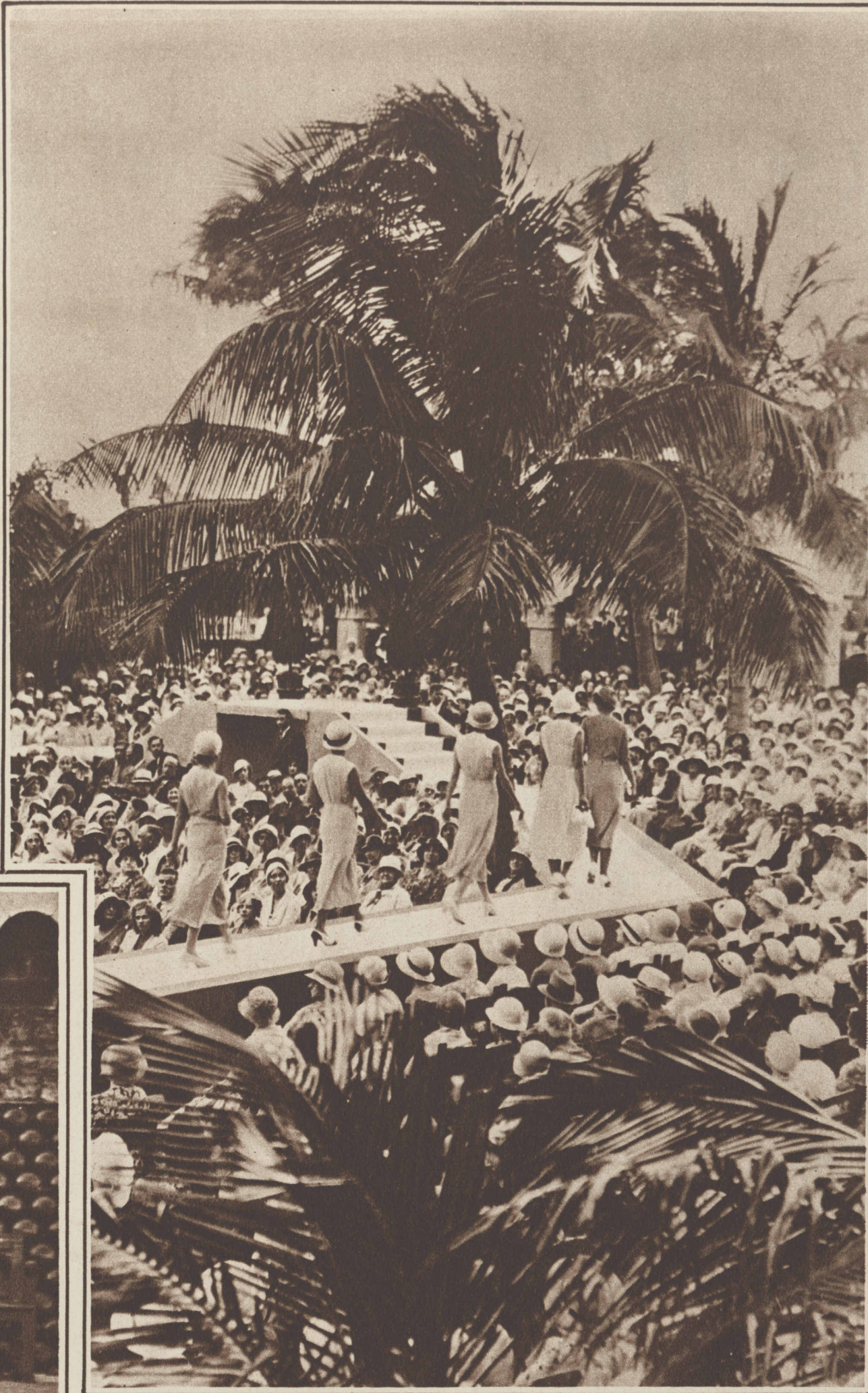
FASHIONS ON PARADE AMONG THE PALMS—Part of the matinee crowd which viewed the parade of mannequins at a recent Miami Beach (Fla.) fashion show. The models here displayed the last word in winter resort spectator sports wear.