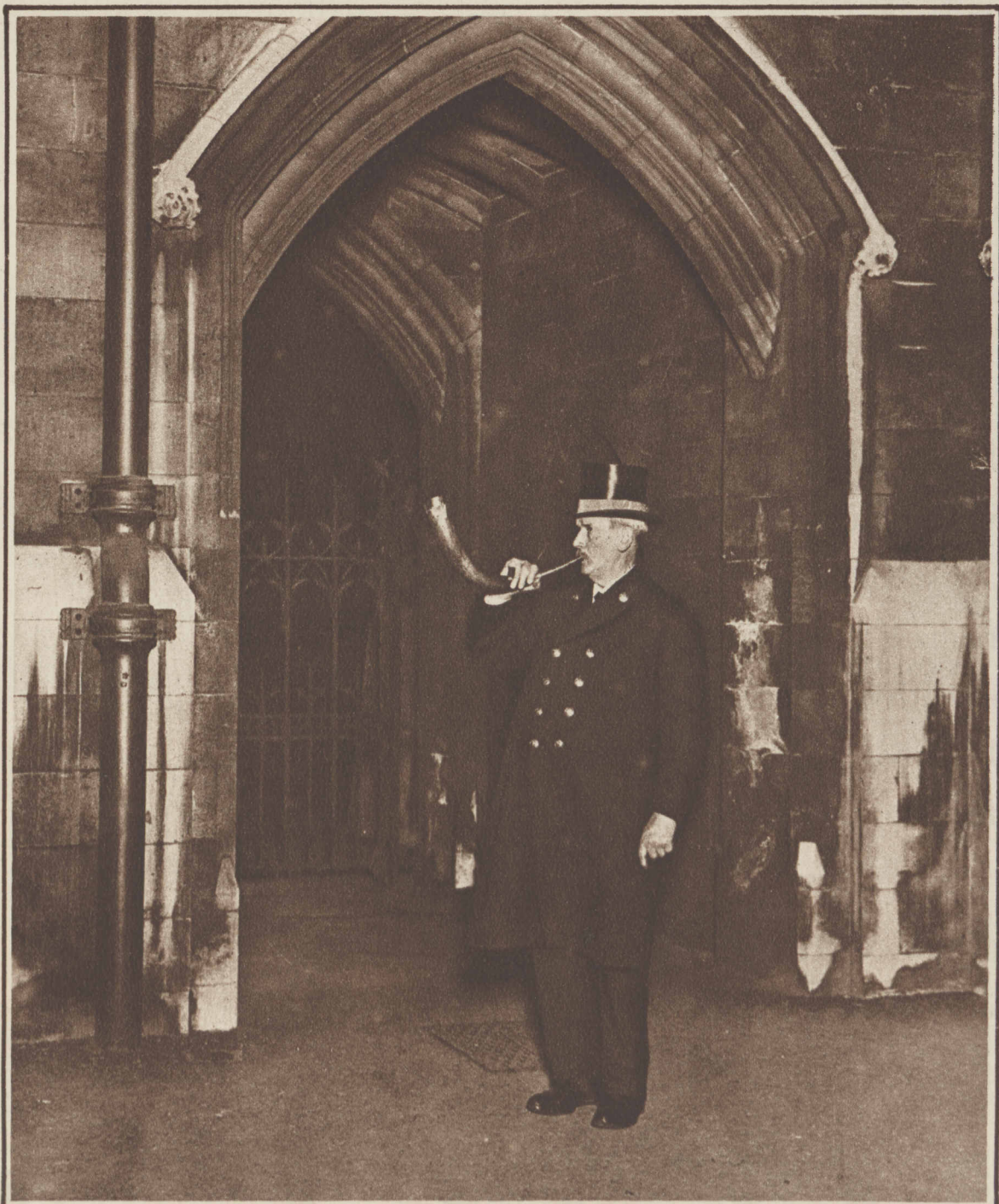
THE CALL TO THE BAR—Prophetic of their coming hunt for clients is this traditional winding of the horn by the warder of the London Middle Temple Court, home of the barristers, announcing the admission, or calling to the bar, of young lawyers newly licensed to practice their profession.