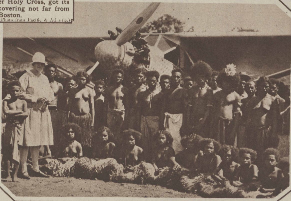
GREETING A WINGED MESSENGER—Natives of Port Moresby, New Guinea, turned out en masse, and, one might say, almost fully clothed, for a tribal celebration when their first airplane arrived from Australia. The machine, built in America, is a sister ship to Lindbergh's "The Spirit of St. Louis."