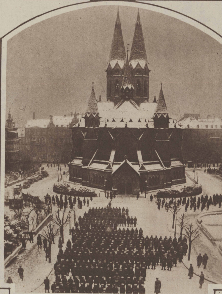
THE WATCH ON THE RHINE—The British royal fusiliers were drawn up in front of the Garrison church, Wiesbaden, Germany, and ready to file in, when the camera clicked this echo of the Great war.