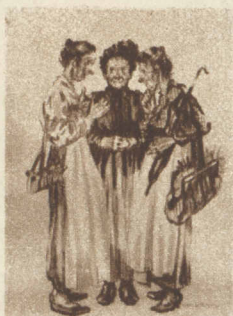
VILLAGE GOSSIPS By NANCY DYER