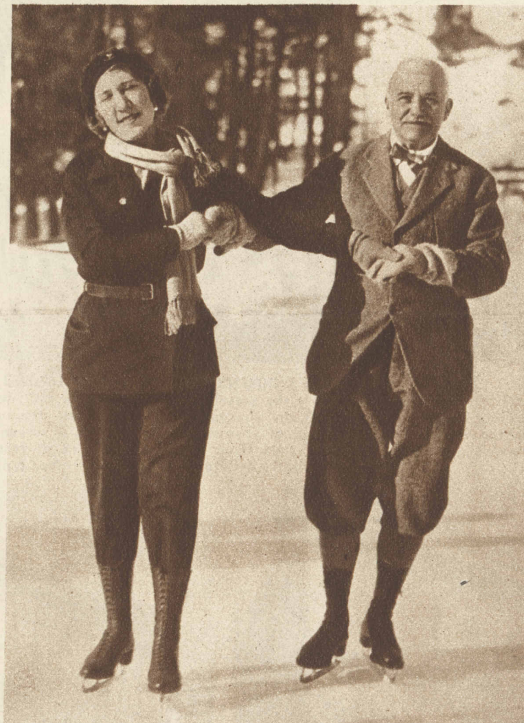
BRITAIN'S ROCKEFELLER GOES ATHLETIC—Sir Henri Deterding, European oil magnate, and Lady Deterding try the skating at their estate near London.