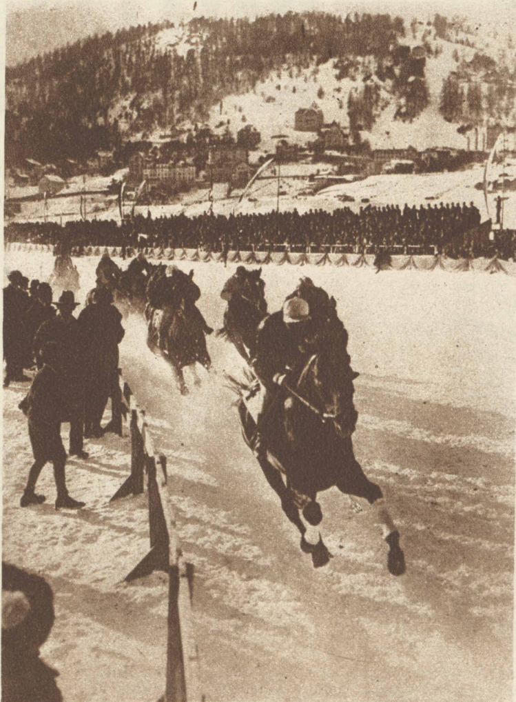
INTO THE STRETCH, BUT NOT ON THE TURF—Horse racing makes its appearance as a winter sport amid the snow near St. Moritz, fashionable Swiss mecca.