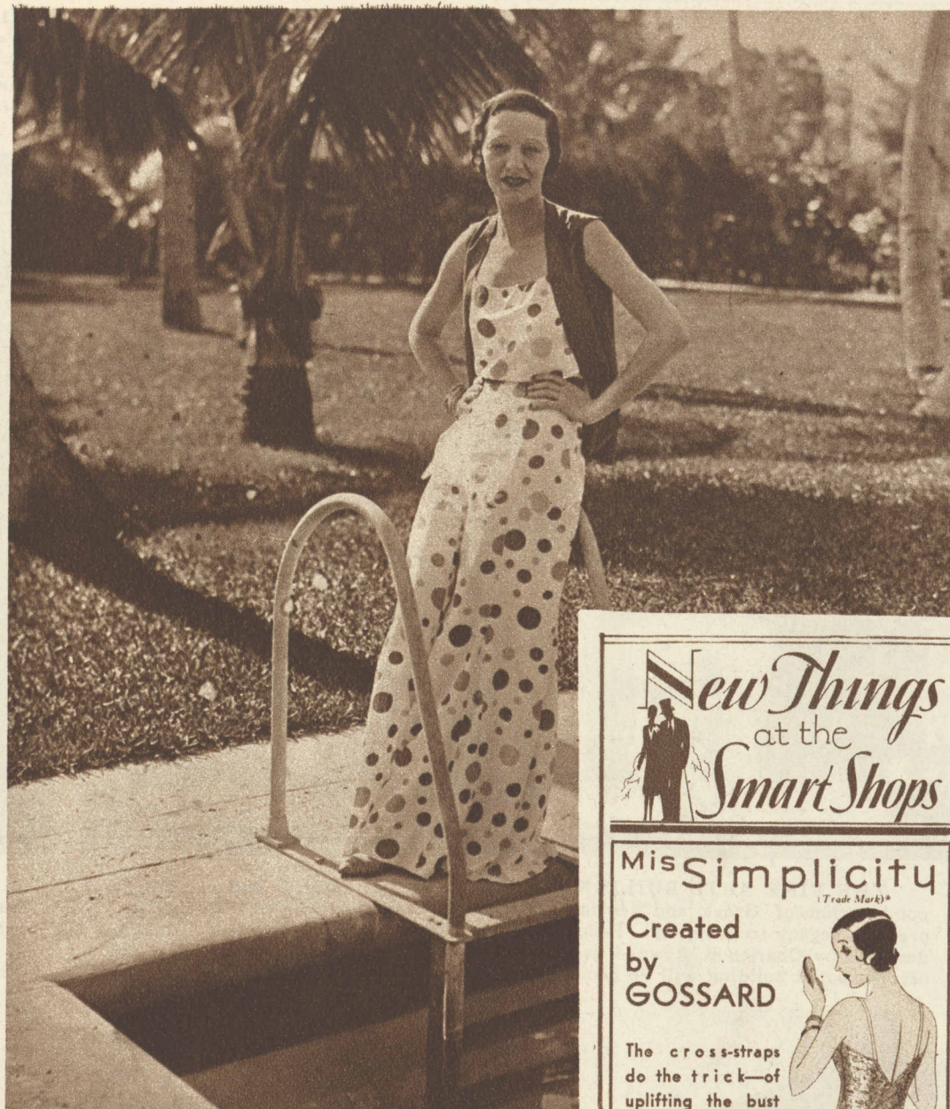
AMONG THE GAYEST BEACH PAJAMAS decorating the Palm Beach scene are those worn by Miss Gertrude Lawrence of the stage, encountered here at the margin of a pool.