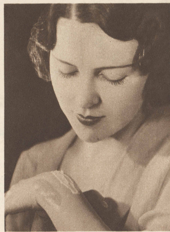
WILL YOU COMPARE? Girl tests ordinary cleansing cream and Hinds Cleansing Cream on arm. At once Hinds melts . . . Other stays solid . . . lardlike . . . Please remember this difference when cleansing cream buying.