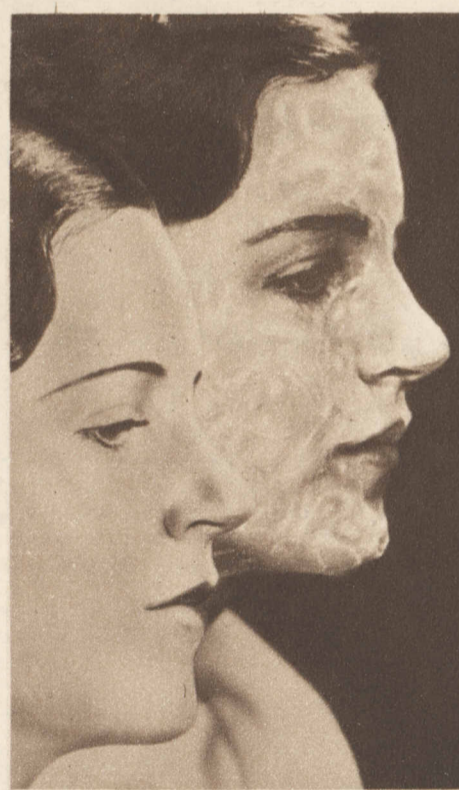
TWO PROFILES show graphically the difference in old-type "heavy" cleansing cream and new Hinds Liquefying Cream. At right, "Heavy" cream . . . At left, Hinds Cleansing Cream.

OPEN EVENINGS Monroe St. Open Thursday Till 10. Other Stores Open Tuesday, Thursday, Saturday, Till 10.