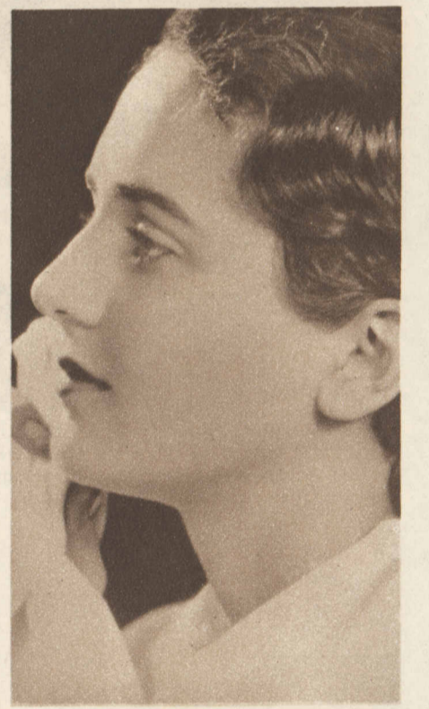
IT MELTS the moment you apply . . . gently penetrates pores . . . removes all dirt . . . wipes away quickly. Needs no heavy rubbing like ordinary cleansing cream to penetrate.