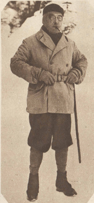
FROST-PROOF —Former Premier Tardieu of France arrayed for a hike at St. Moritz.