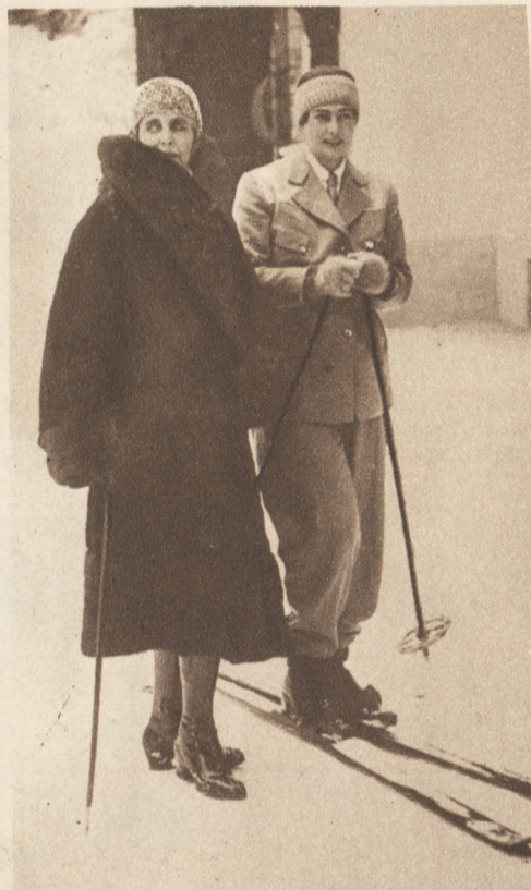
A PRINCESS ON SKIS —Ileana of Rumania and Queen Mother Marie go in for sports at Sinaia.