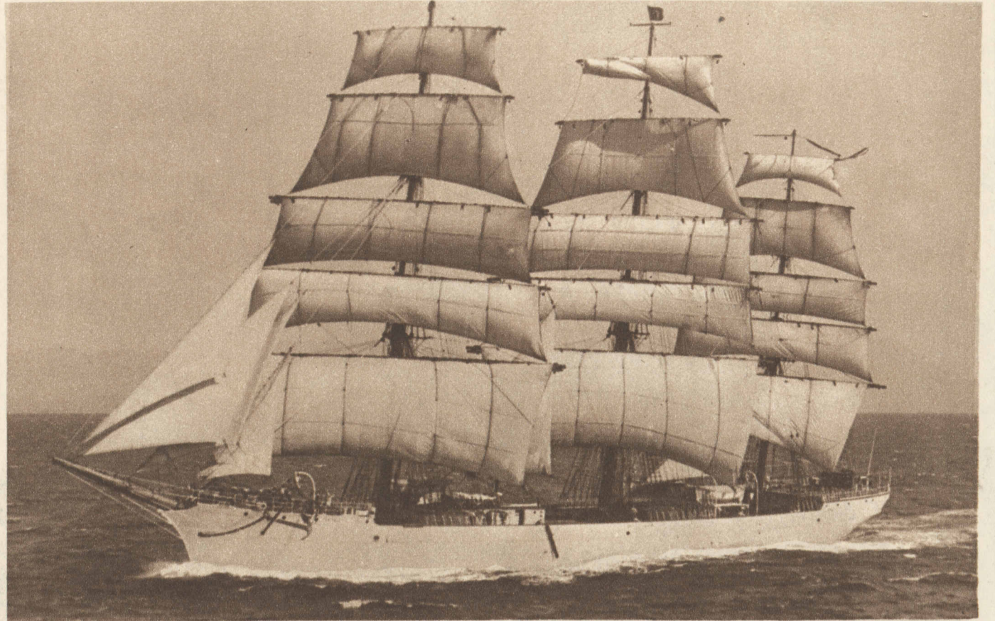
LIKE A PICTURE FROM OUT OF THE PAST , the three-masted schooner Tusitala gracefully sails the sea between Honolulu and New York. Owned by James A. Farrell, the steel magnate, the vessel voyages yearly to Hawaii.