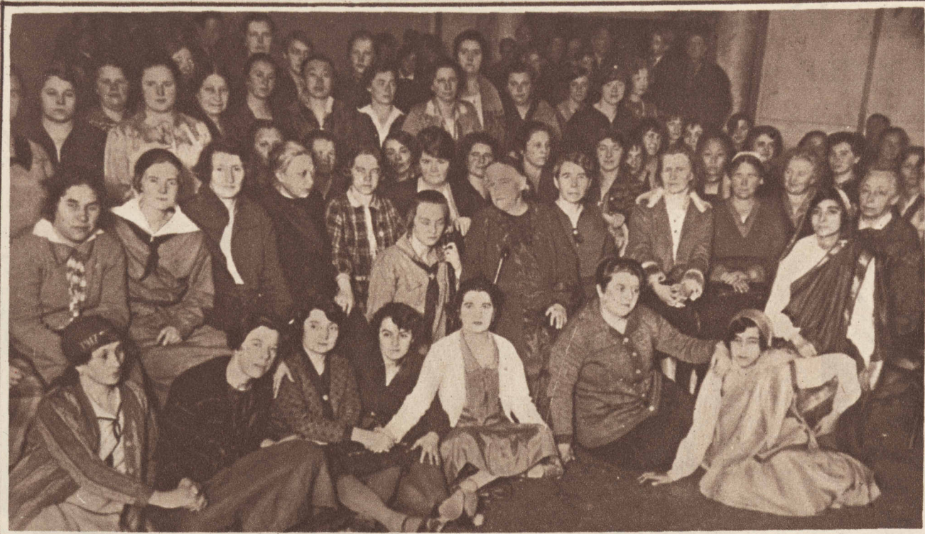
MOSCOW'S CONGRESS OF WOMEN brought together this unique gathering of feminist leaders not only from the soviet republics, but also from many other countries of Europe. Among them were women from all walks of life, from stern leaders of the Russian peasant class to richly clad, dainty aristocrats from noncommunitic nations.