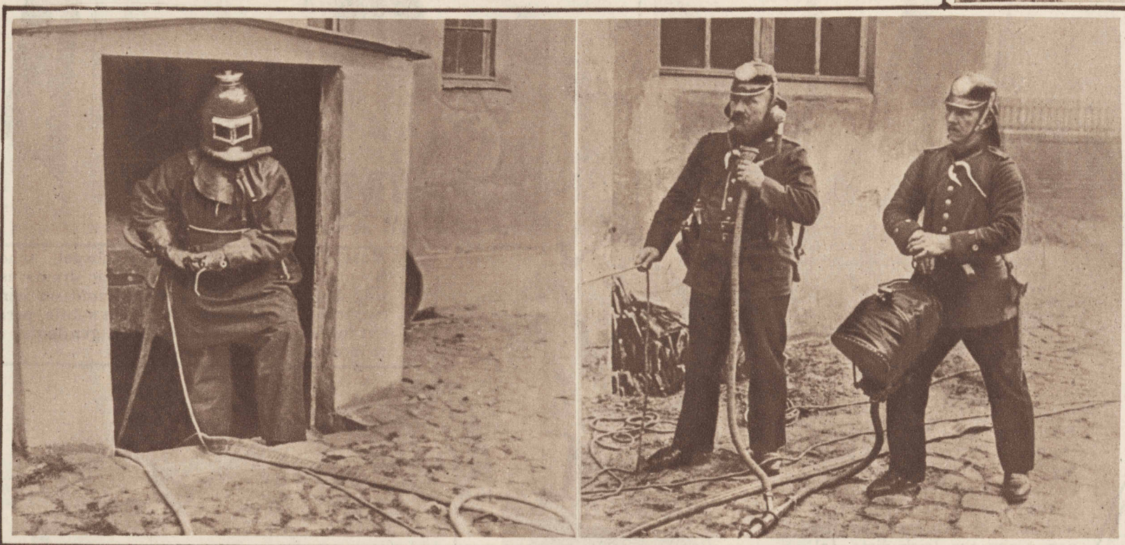
A DIVING SMOKE-EATER—Germany presents the latest wrinkle in fire-fighting apparatus, a fireman's diving suit which is hermetically sealed, with a water spray overhead and a smoke mask to which air is pumped by a bellows. Communication with the wearer is maintained through the speaking tube held by the Emil Jannings-looking man in the center.