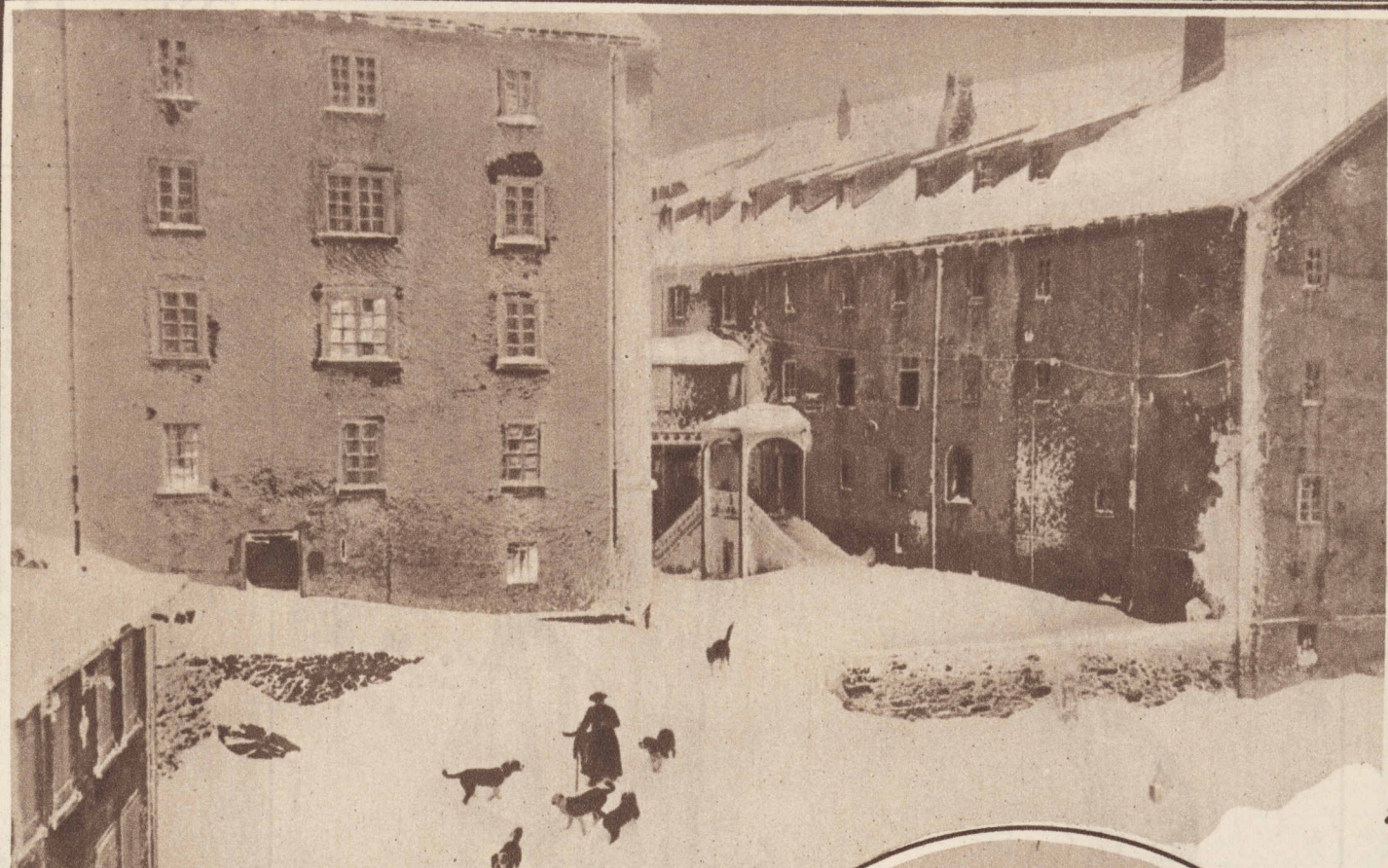
A GODSEND TO LOST WAYFARERS IN THE ALPS is the St. Bernard hospice, pictured above. It is 8,000 feet above sea level, on a pass between Switzerland and Italy. Countless itinerants have been saved from death through the heroic work of the monks here, locked in the land of eternal snow. At the right is one of the hospice monks with Lion, the finest St. Bernard at the institution. Lion has found and rendered succor to many lost and frozen travelers.