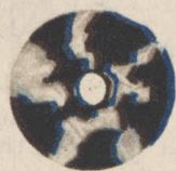
Identify the Lifetime pen by this white dot

That is our Pledge. Your Lifetime Pen is guaranteed un- conditionally for your life, and your Lifetime Pencil is forever guaran- teed against defect