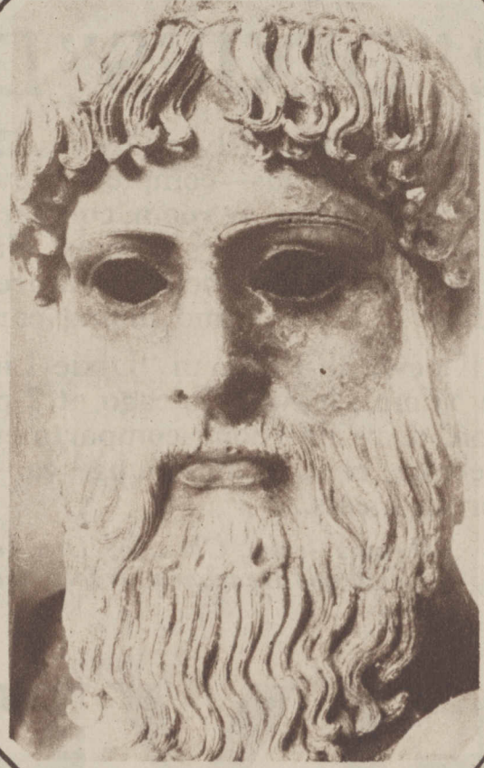
THE SEA GIVES UP ITS GOD—Pirates in the pay of continental art dealers were surprised in the act of raising an ancient vessel, rich with specimens of finest Grecian bronze, off the island of Euboea. This Neptune, pronounced superb by archaeologists, was among the pieces recovered.