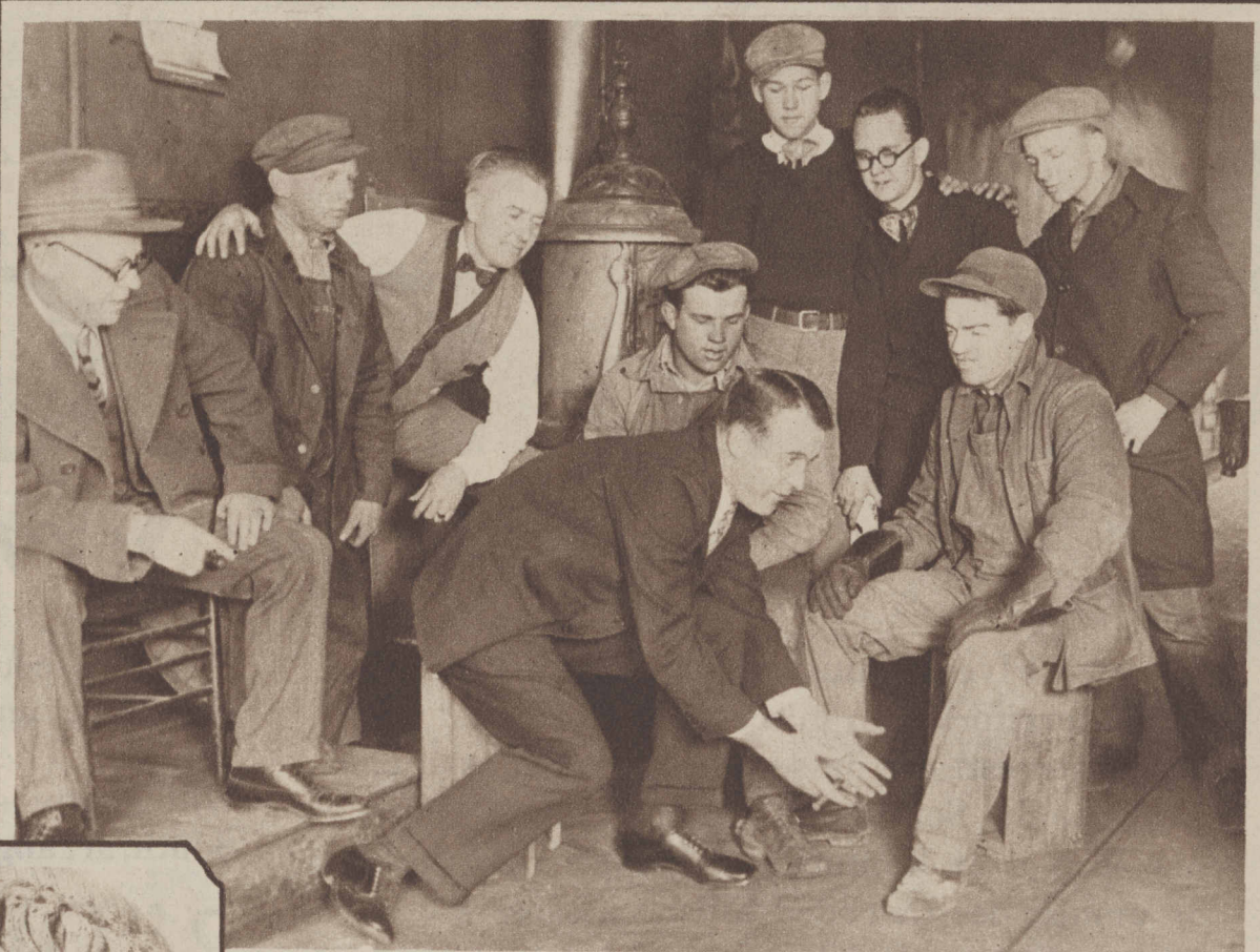
THE HOT STOVE LEAGUE CONVENES around the National league's most valuable player, "Sunny" Jim Bottomley of the St. Louis Cardinals, at his old home town. The o. h. t., be it added, is Nokomis, Ill., where Bottomley is selling automobiles, hiking, and hunting to take up the winter slack of the baseball business.