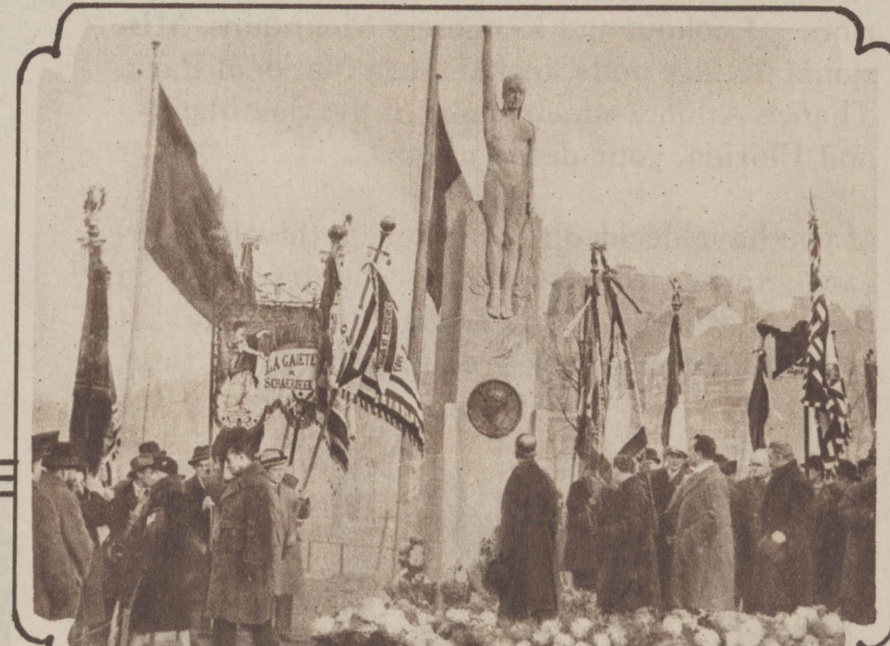
A MONUMENT TO SPEED VICTIMS is this unique shaft at Schaerbeek, Belgium. Banners flew in elaborate civic ceremony, during which the camera clicked, at the dedication of the memorial to persons killed in auto and racing accidents.