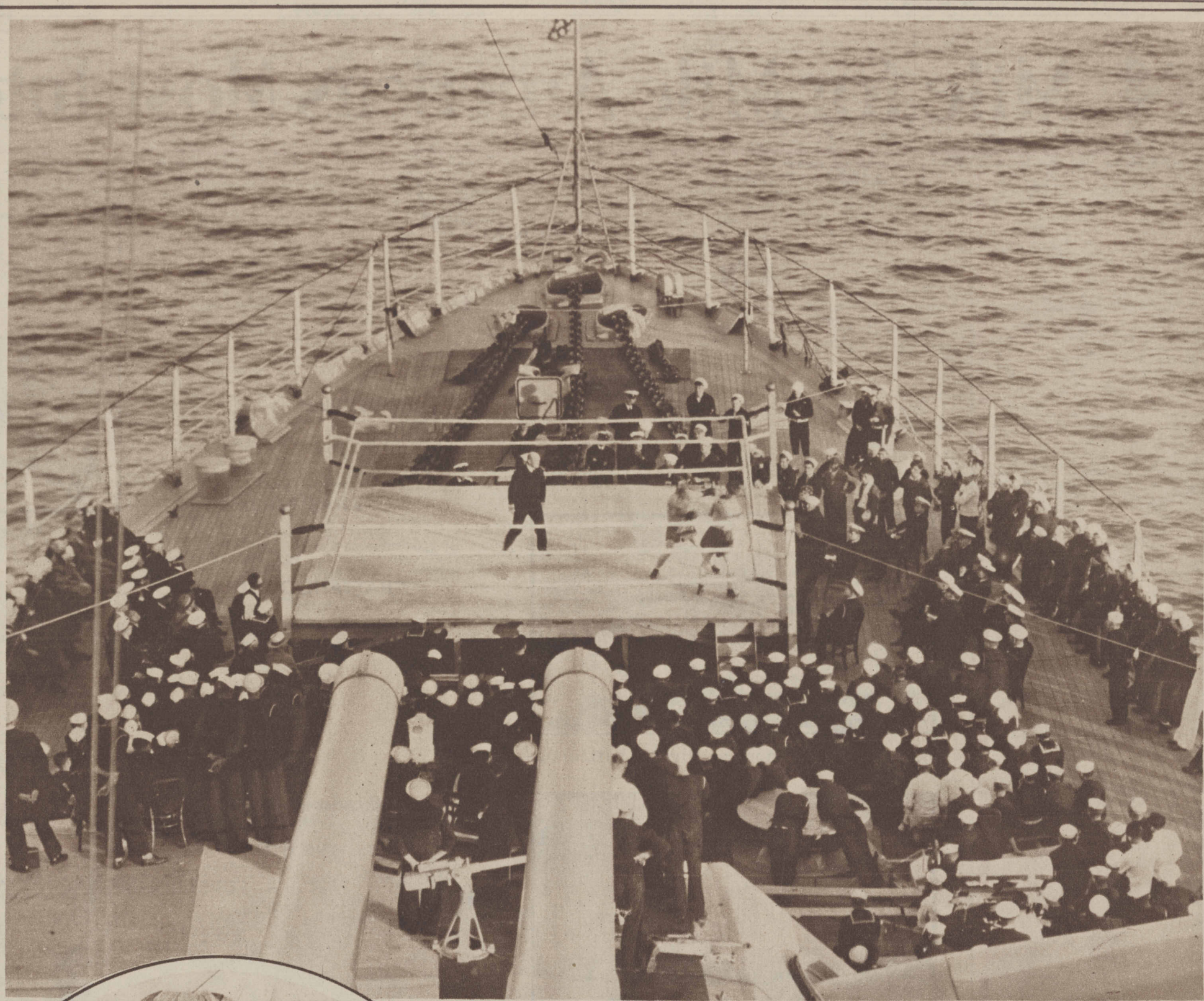
THE MANLY ART OF SELF-DEFENSE, cultivated by some 999 out of a thousand sailors on the off chance that they may meet up with a marine in a dark alley some night, is practiced in a shipboard exemplification somewhere along the Atlantic coast. The ring is beneath the gaping guns of the California.