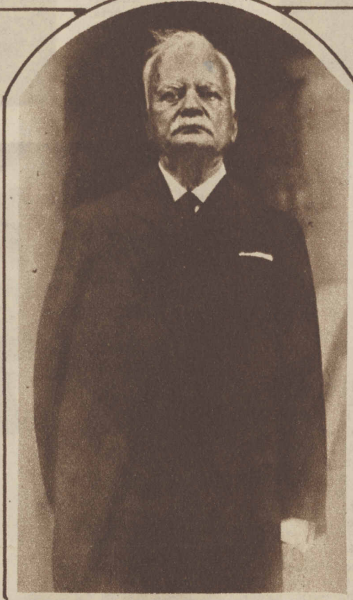
AT THE HELM IN GREECE —By an overwhelming majority Alexander Zaimis, former premier, was elected president of the republic. He succeeds Admiral Kondouriotis, who resigned because of advanced age and ill health.