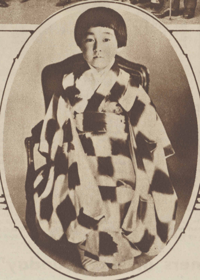
A ROYAL LITTLE CHERRY BLOSSOM is Princess Shigeko, daughter of the Japanese emperor, who had this picture taken on her fourth birthday.