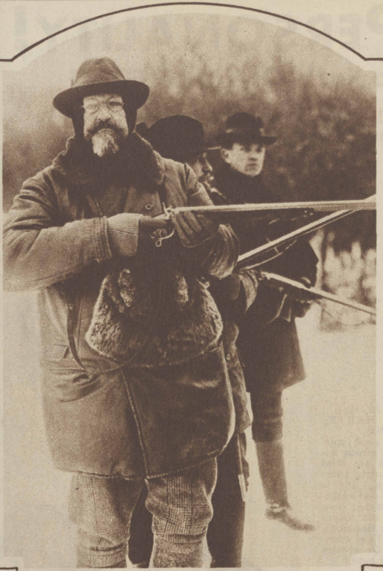
'MID PLEASURES BUT NO PALACES , former Czar Ferdinand of Bulgaria whiles away winter hours of retirement at the hunt. You will remember that he was one of the royal casualties of 1918, abdicating in favor of his son, Boris. The shooting scene is his estate in Hungary.