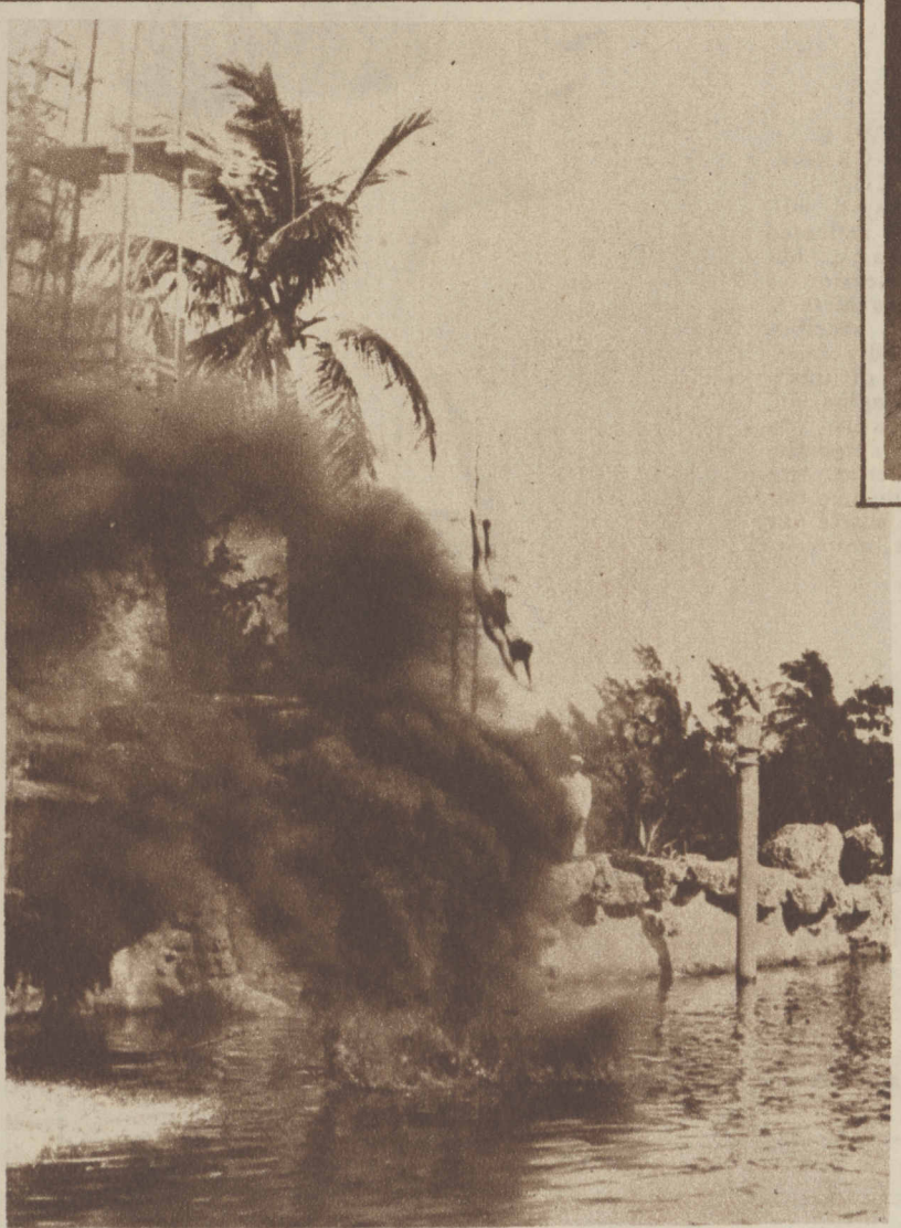
INTO A POOL OF FLAME leaps a nine year old diver, Jackie Ott, performing one of his spectacular feats at Miami. Fifty gallons of gasoline were poured upon the water and ignited—and then Jackie sprang into the pool from a thirty foot tower.