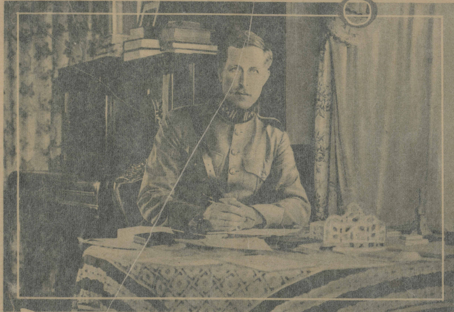
LATEST PICTURE OF KING ALBERT OF BELGIUM —Surrounded by the meager and simple furnishings in a crowded room, the king of the Belgians works daily at his headquarters with the Belgian army at the front.