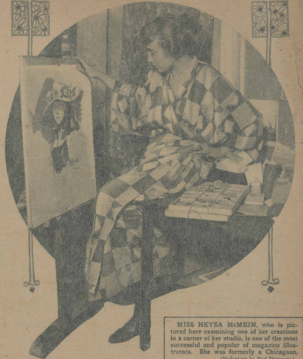
MISS NEYSA McMEIN , who is pictured here examining one of her creations in a corner of her studio, is one of the most successful and popular of magazine illustrators. She was formerly a Chicagoan.