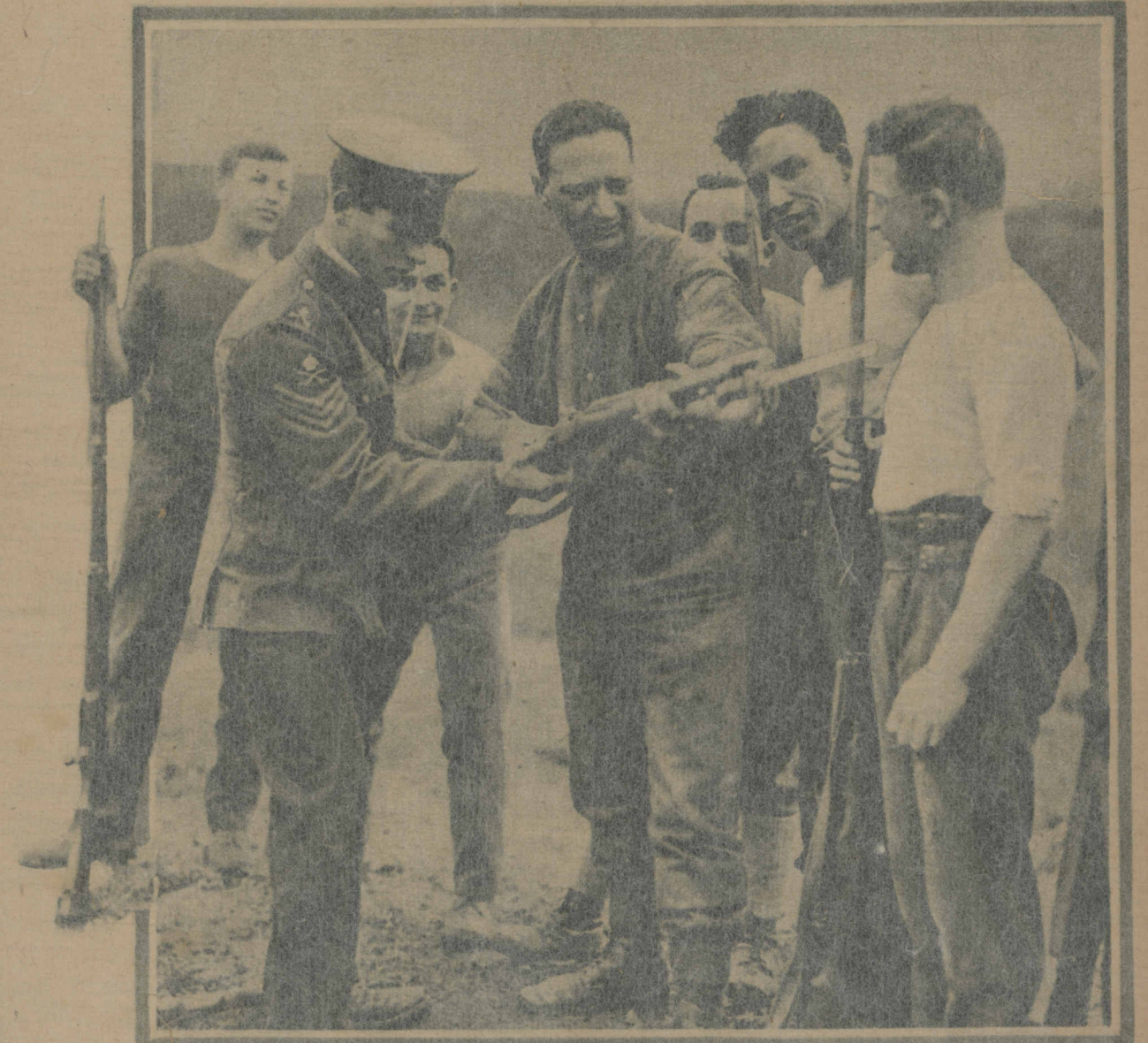
FAMOUS SCULPTOR A ROOKIE —Jacob Epstein, one of the most daringly original sculptors, is a private in the Jewish battalion of the British Royal Fusiliers. His work has been acclaimed by the most discerning art critics. Mr. Epstein is being taught, in the picture, to handle his rifle in a bayonet charge.