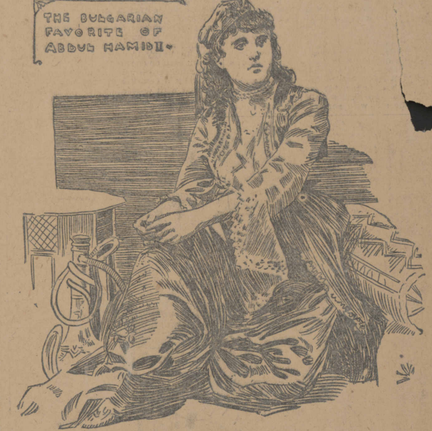
Stories from the Seraglio of the Sultan of Turkey Told by One Who Has Had Unusual Chances of Gaining Information.