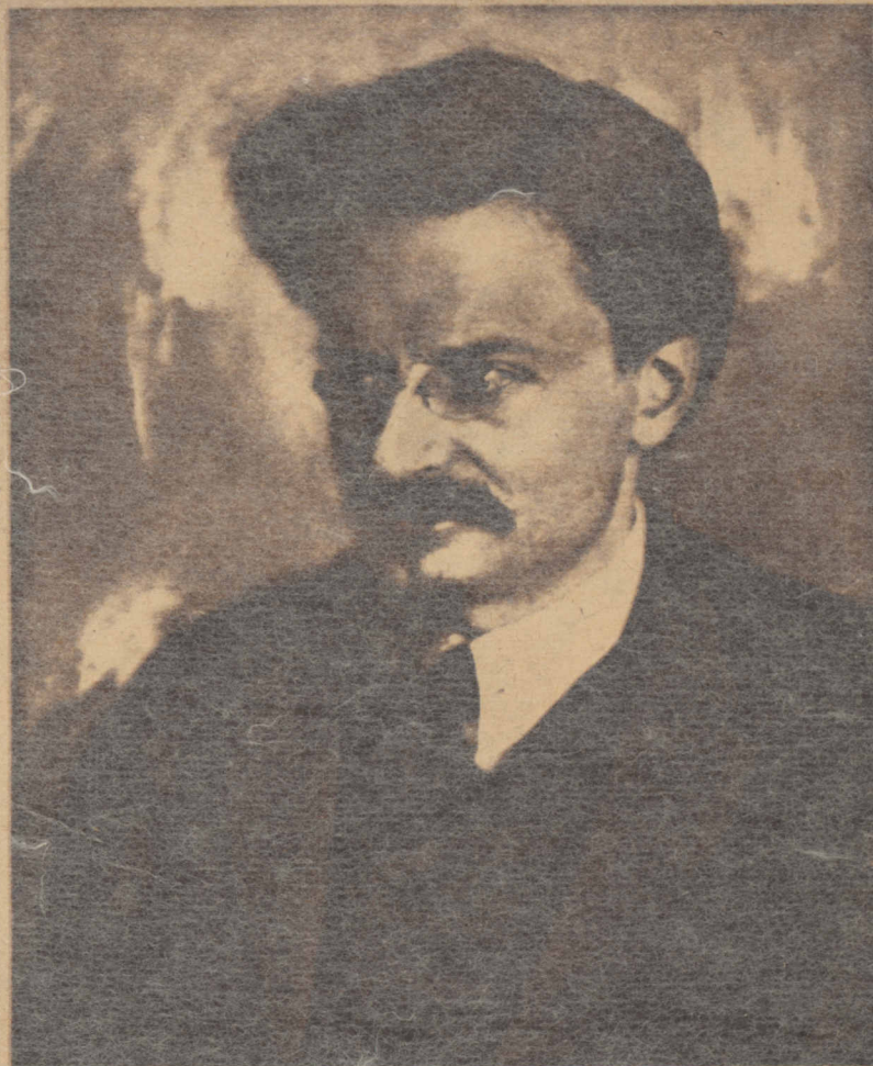
Л. Д. ТРОЦКИЙ.

AS SEEN BY THEIR FRIENDS—Propaganda portraits, elaborately prepared and distributed throughout Russia during the period of Bolshevik rule. At the left, Lenin, otherwise Vladimir Ilitch Ulianoff, the virtual dictator of Bolshevik Russia and one of the few genuine Russians in the movement. At the right, Trotzky, the fiery Jew, who, as commissary for war, has been sarcastically dubbed by his opponents "the greatest Jewish general since Joshua." His real name is Leiba Bronstein.