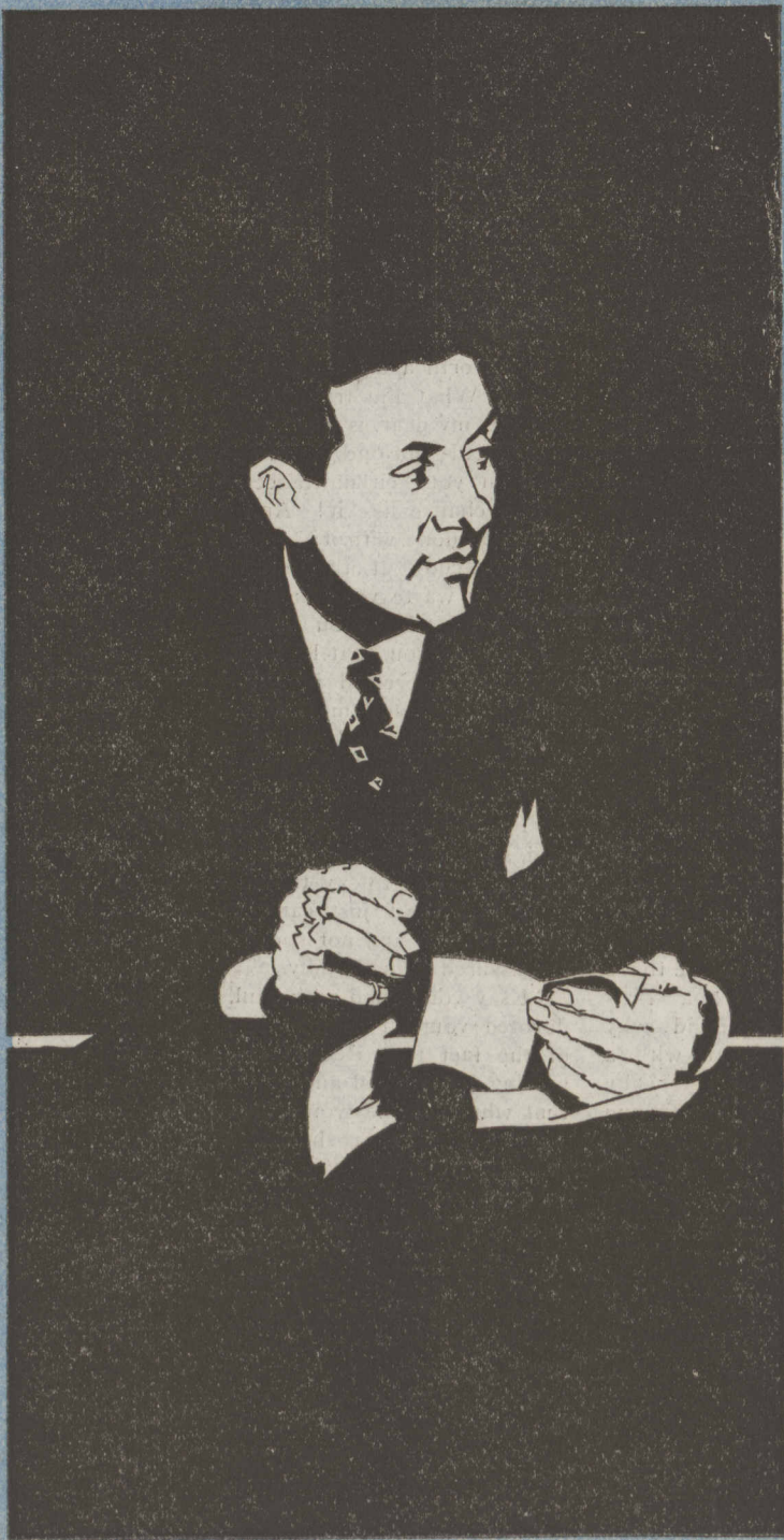
GOV. FLOYD B. OLSON OF MINNESOTA

"To the guillotine with the people who hold all the money."