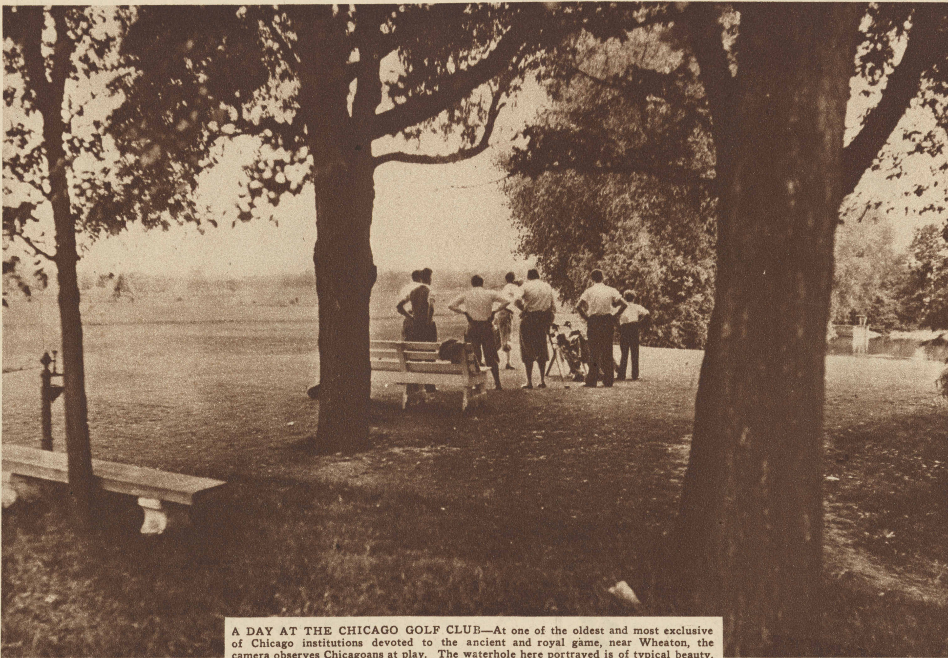
A DAY AT THE CHICAGO GOLF CLUB—At one of the oldest and most exclusive of Chicago institutions devoted to the ancient and royal game, near Wheaton, the camera observes Chicagoans at play. The waterhole here portrayed is of typical beauty.

Loop Salesroom 17 North State Street 14th Floor, Stevens Building Open Daily till 6 P. M.