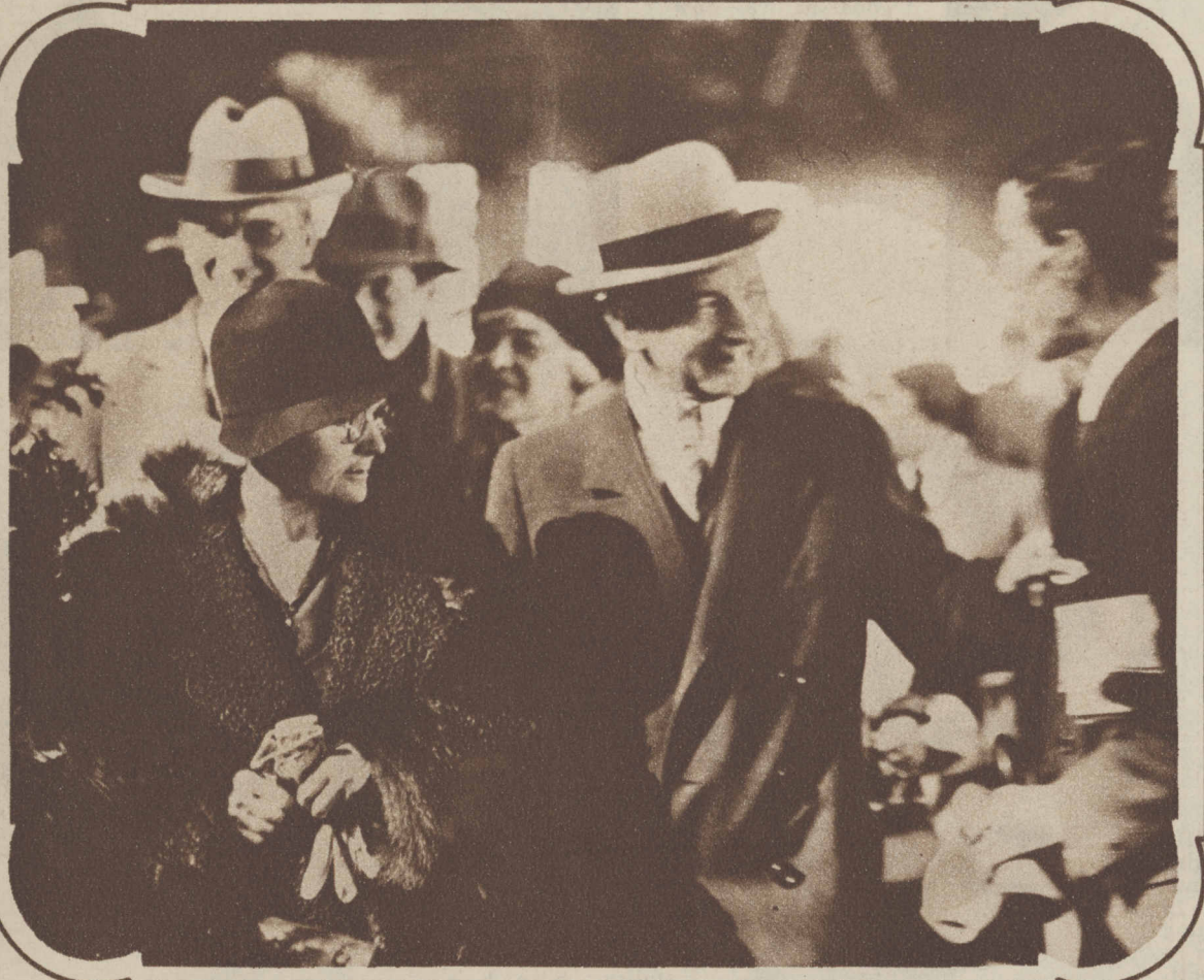
TWO WORLD CELEBRITIES , Mme. Marie Curie and Charles G. Dawes, arrived in America on the same liner from Europe. The ambassador was on his way to Chicago; the woman scientist came to receive from her admirers a second gift of radium, the element she and her husband discovered.

Check the Most Convenient Time for Appointment Week Days Sundays Evenings