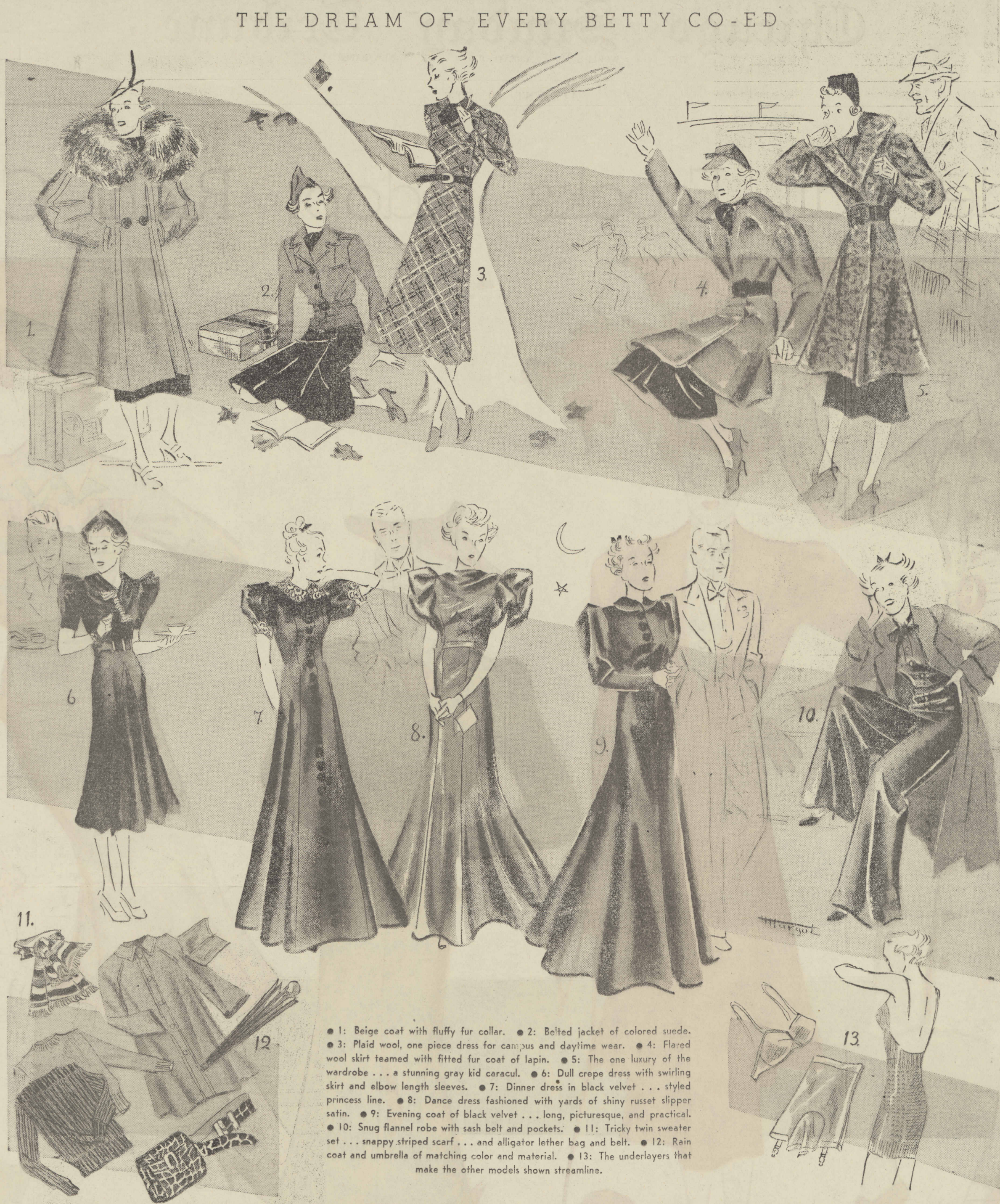
● 1: Beige coat with fluffy fur collar. ● 2: Belted jacket of colored suede. ● 3: Plaid wool, one piece dress for campus and daytime wear. ● 4: Flared wool skirt teamed with fitted fur coat of lapin. ● 5: The one luxury of the wardrobe . . . a stunning gray kid caracul. ● 6: Dull crepe dress with swirling skirt and elbow length sleeves. ● 7: Dinner dress in black velvet . . . styled princess line. ● 8: Dance dress fashioned with yards of shiny russet slipper satin. ● 9: Evening coat of black velvet . . . long, picturesque, and practical. ● 10: Snuggly flannel robe with sash belt and pockets. ● 11: Tricky twin sweater set . . . snappy striped scarf . . . and alligator leather bag and belt. ● 12: Rain coat and umbrella of matching color and material. ● 13: The underlayers that make the other models shown streamlines.

1. A beige coat with a fluffy fur collar . . . effective for your first entrance . . . wearable from dawn till dark over suits, with skirts and dresses, with or without hats . . . can be found in other colors, too. 2. Runner-up for the sweater and skirt uniform idea . . . the colored suede, belted jacket, soft as velvet, warm as a toasted muffin and fitted warm as well as swank. Under it are worn the wool flared skirts, new this season. 3. The daring, plaid wool, one piece dress for campus and