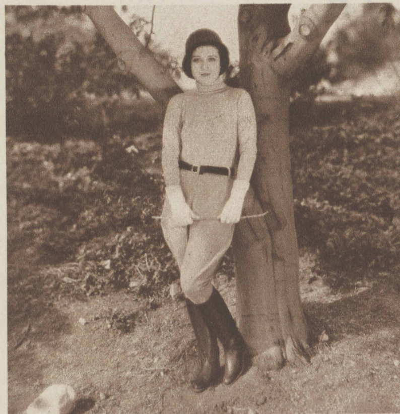
HOW TO DRESS FOR THE BRIDLE PATH—A smart photographic tip from Sidney Fox of the film colony. She wears a brown felt hat, tan whipcord breeches, yellow turtle neck jersey sweater, and tan riding boots.