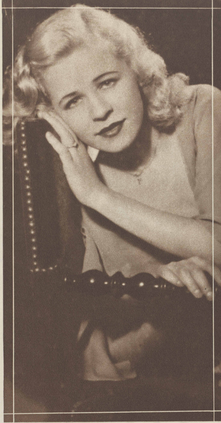
A YOUNG RECRUIT for the American stage from Poland, Lyda Roberti. She has a New York hit to her credit in a musical show called "You Said It."