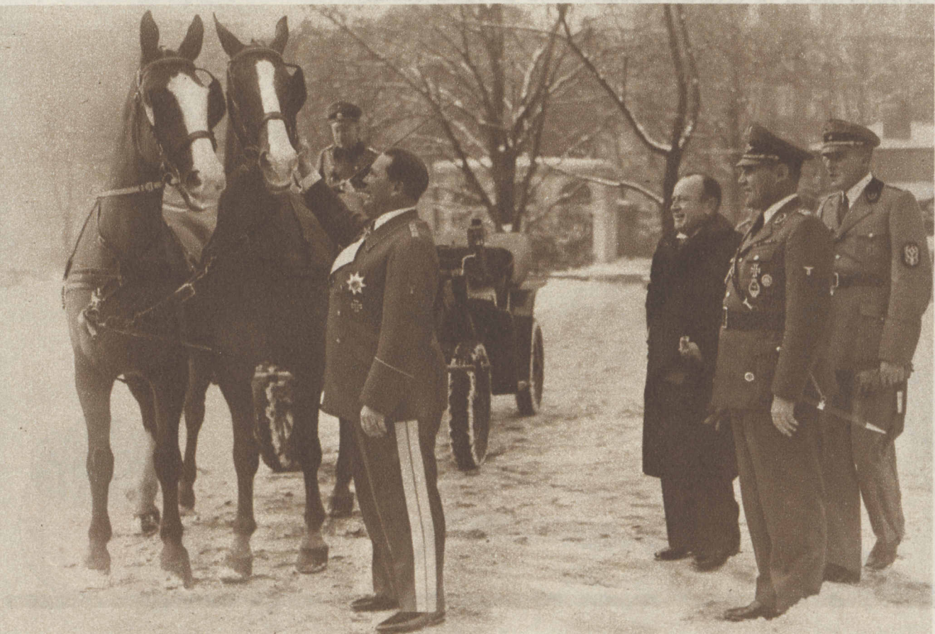
BIRTHDAY PRESENT FOR PRUSSIA'S PREMIER—Hermann Goering admires horses presented by a Hanover friend.