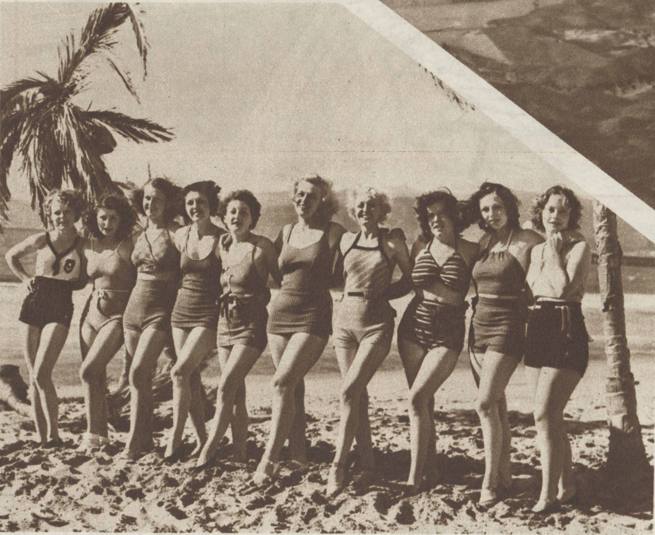
1935 BEACH WEAR on view at Venice, Cal.