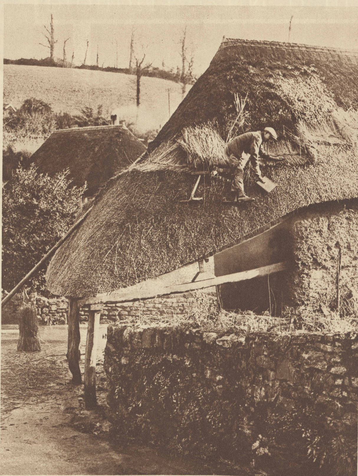
From The Chicago Tribune's London bureau A NEW THATCH FOR COCKINGTON FORGE, DEVONSHIRE, ENGLAND.