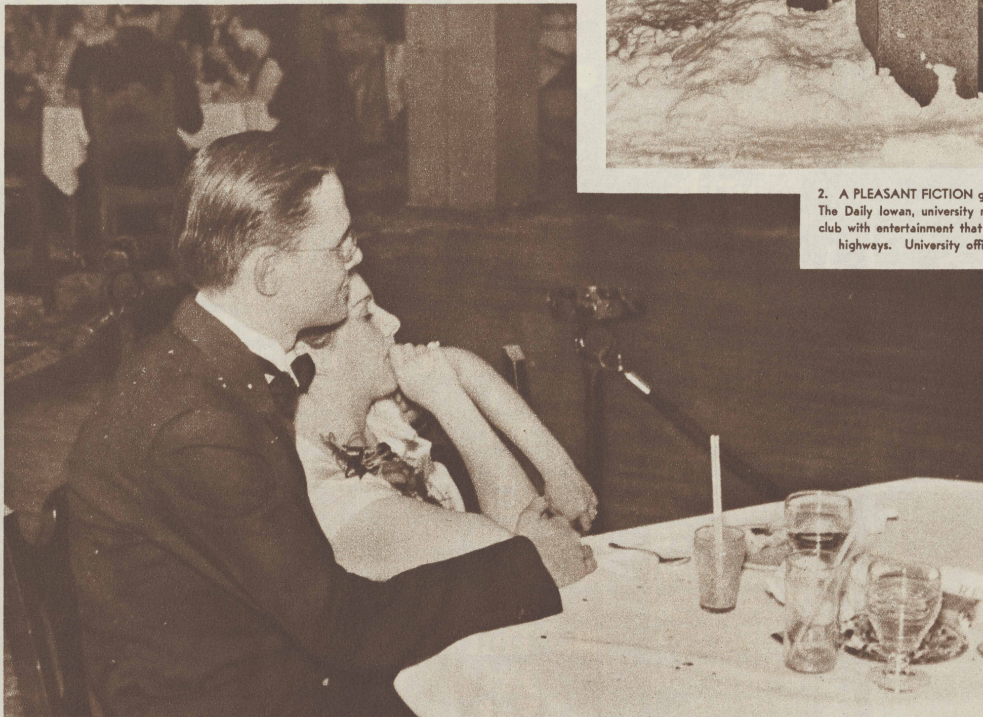
3. ROMANCE appears to flourish under the influence of soft lights and sweet music.