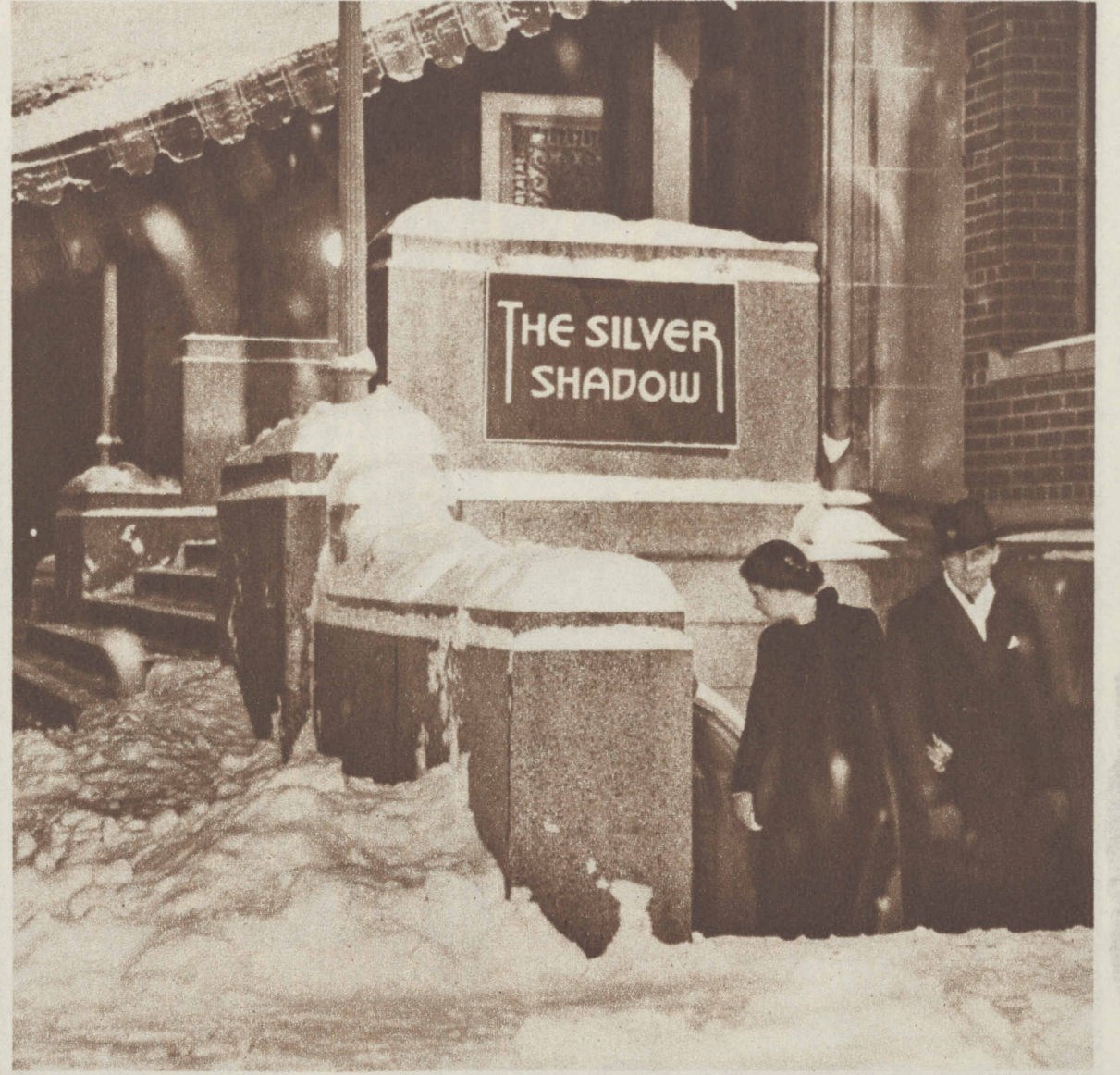
2. A PLEASANT FICTION gives the innocuous cabaret its name. The Daily Iowan, university newspaper, campaigned for a night club with entertainment that would keep students off dangerous highways. University officials christened it diplomatically.