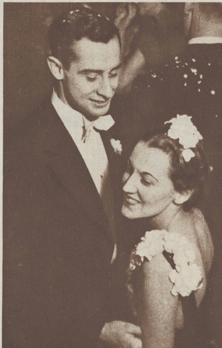
5. DANCING, of course; and a student stage show gives a further authentic touch to the night club atmosphere.