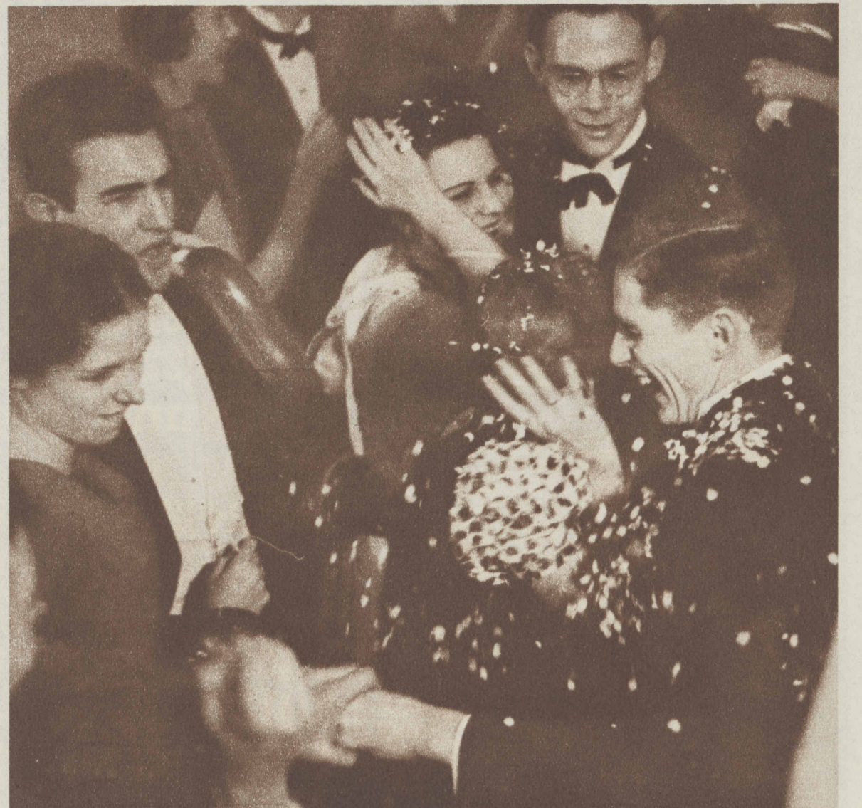
6. YOUTHFUL SPIRITS, armed with such traditional appurtenances of the metropolitan pleasure places as confetti, paper streamers, and toy balloons, induce the hilarity effected in city hot spots by liquid dynamite. "Every one," said the Tribune photographer, "had a good time."